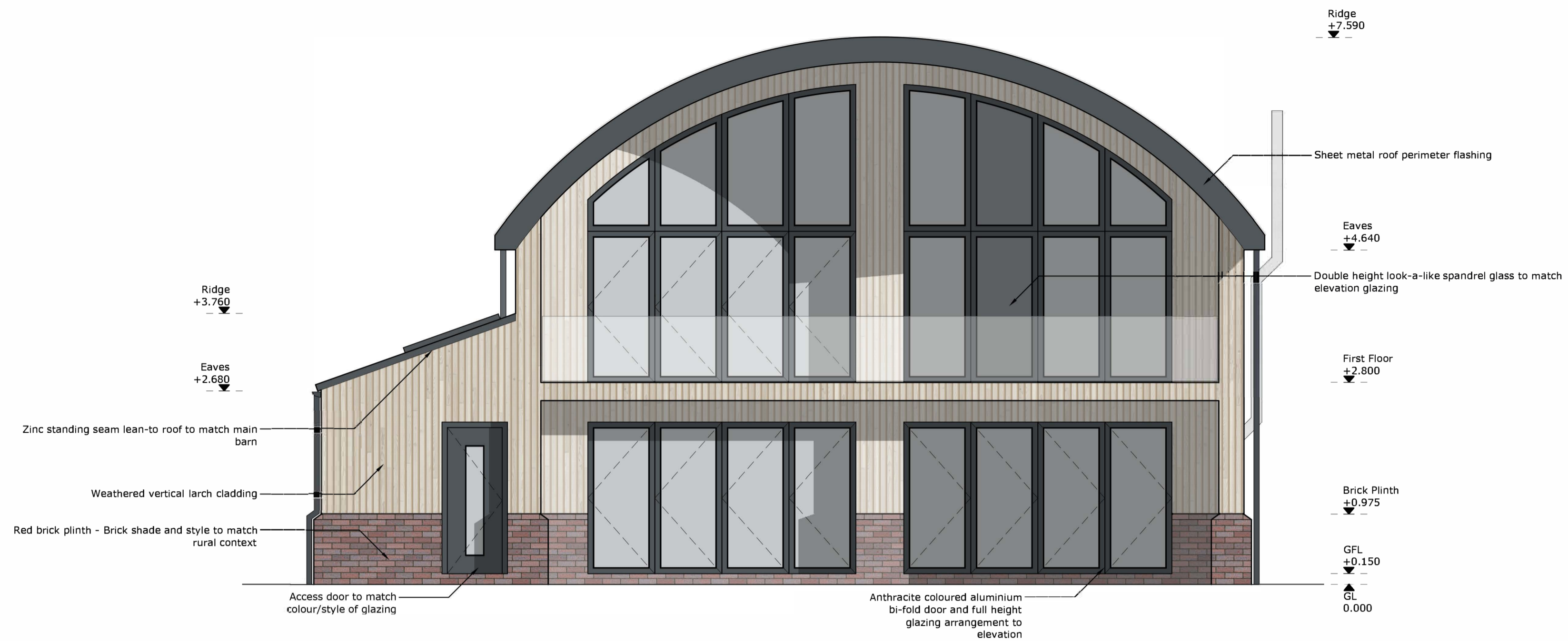
Elevation A - North