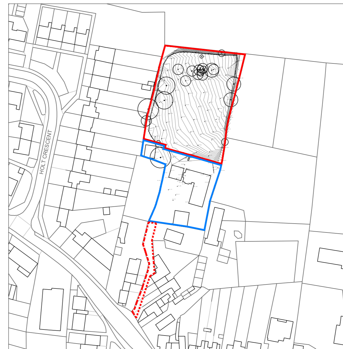
Location Plan Scale 1:1250 @ A2