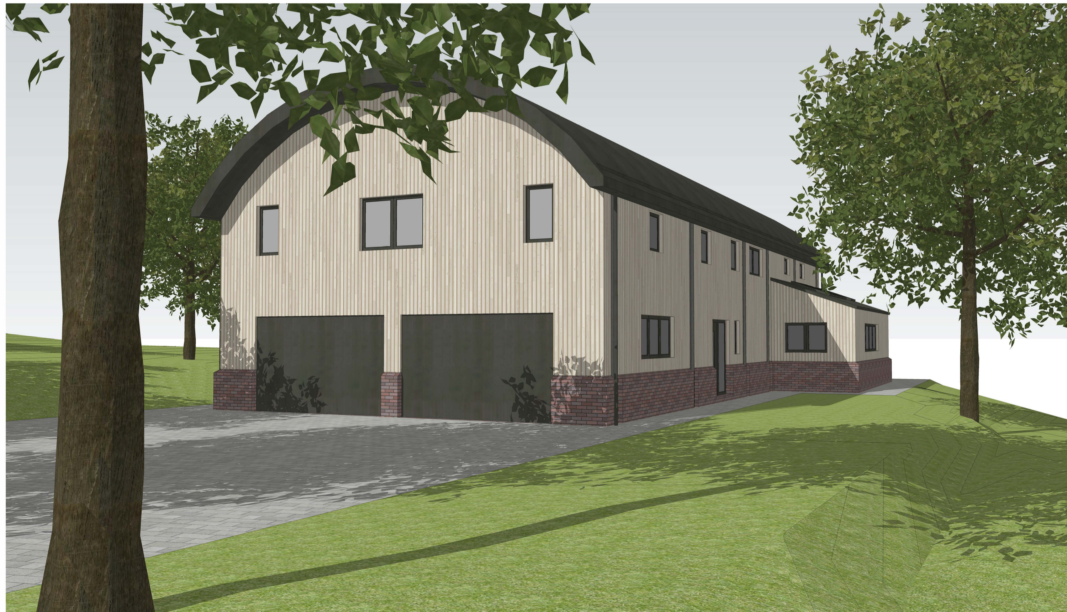
View B - South East