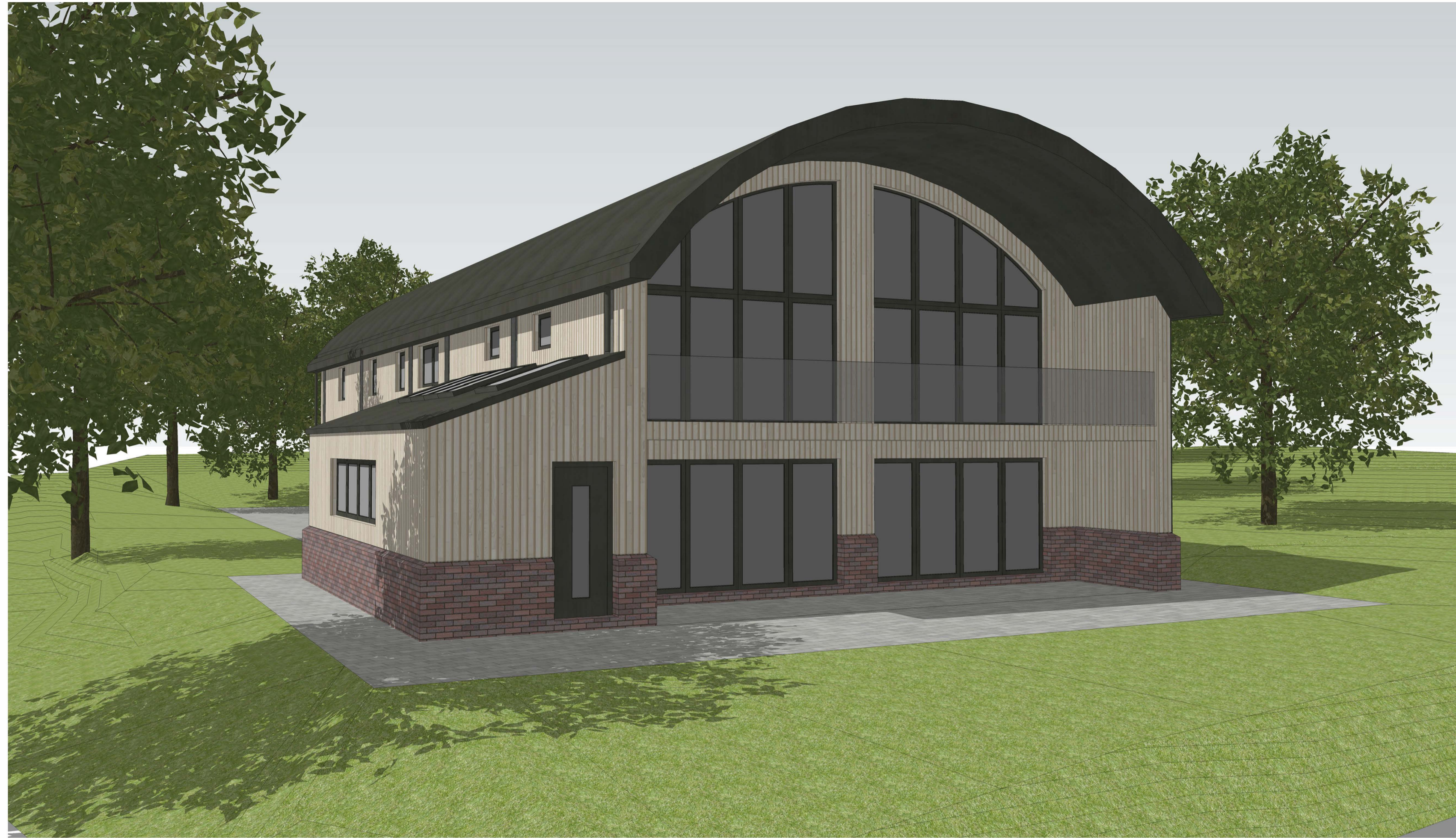
View A - North East