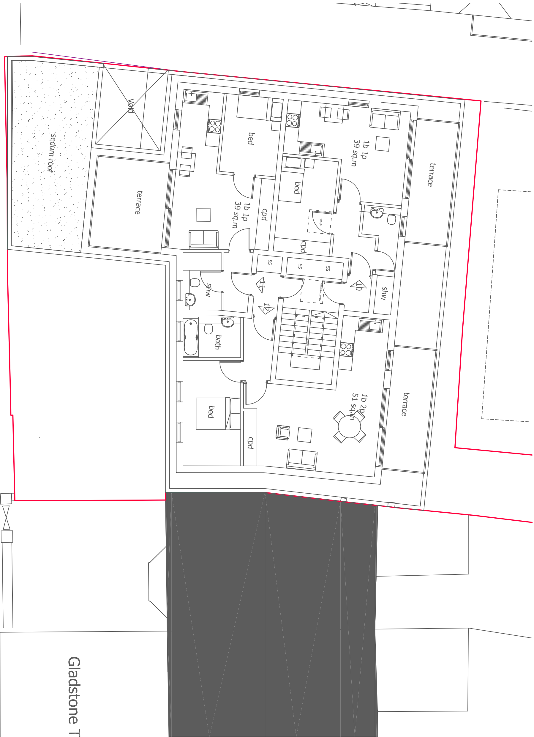
Third Floor Plan