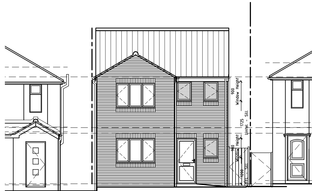
PROPOSED SOUTH EAST (FRONT) ELEVATION