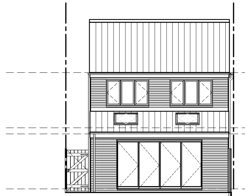
PROPOSED NORTH WEST (REAR) ELEVATION