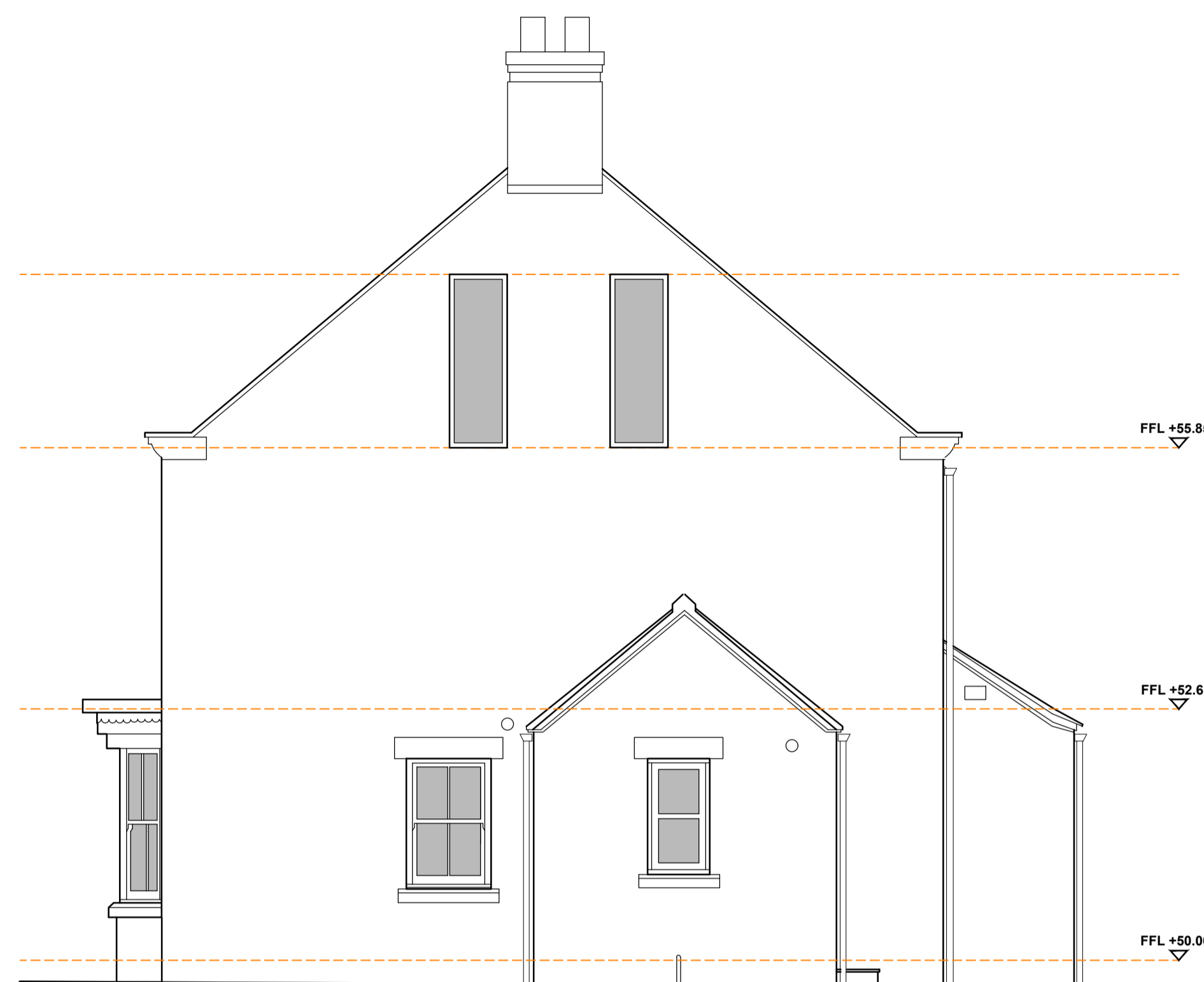
○ North Elevation as Proposed 1:50