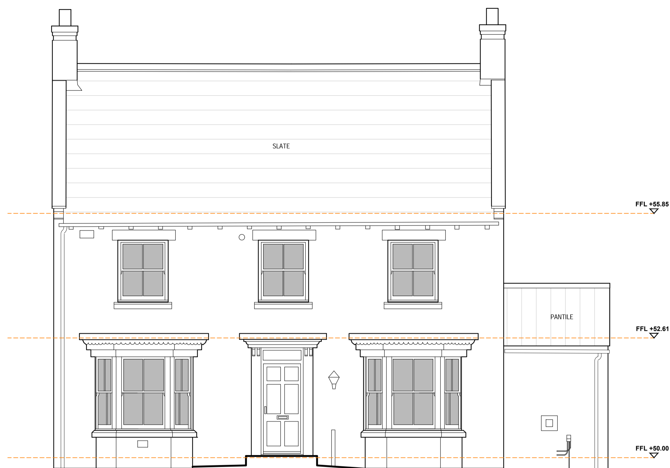
○ Front Elevation as Proposed (West) 1:50

COPYRIGHT OF STEAD & CO (UK) LTD DO NOT SCALE OFF THIS DRAWING. WORK TO FIGURED DIMENSIONS. ANY DISCREPANCY SHOULD BE REPORTED TO THE ARCHITECT