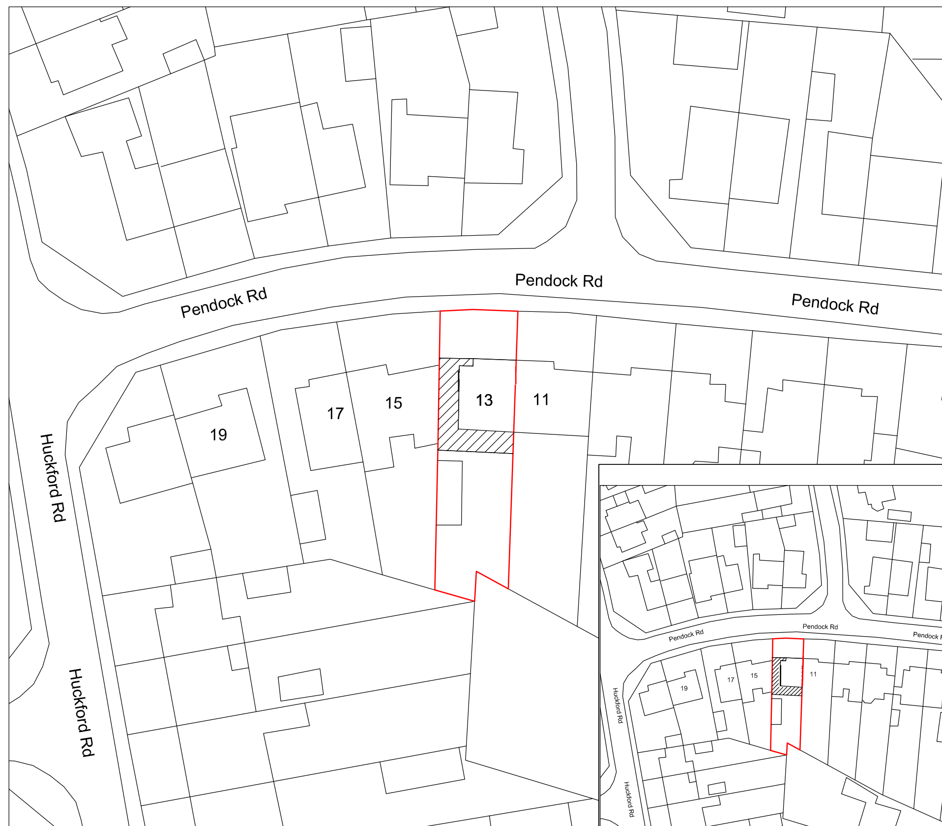
SITE BLOCK PLAN SCALE 1:500