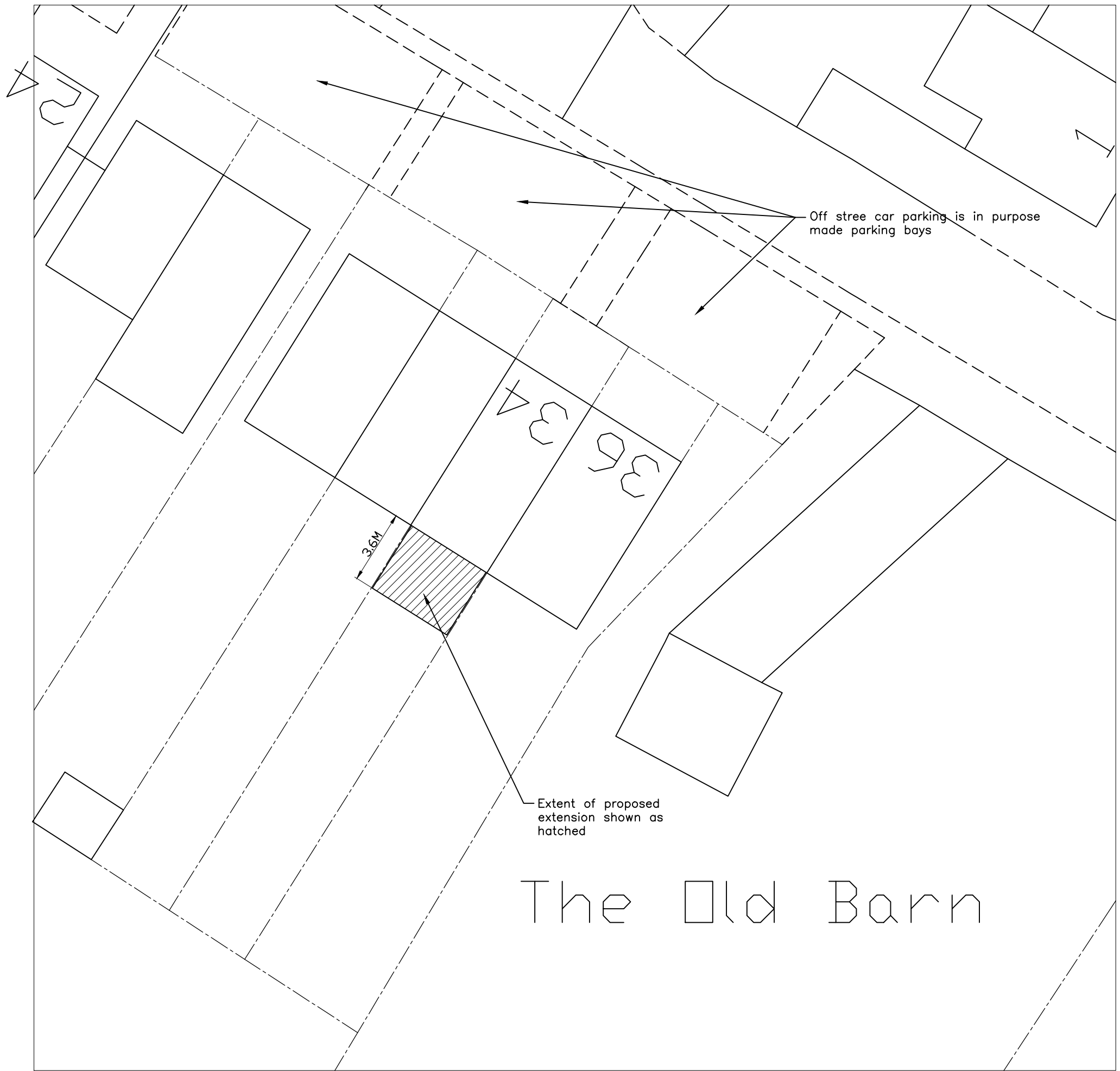
BLOCK PLAN (1:200)