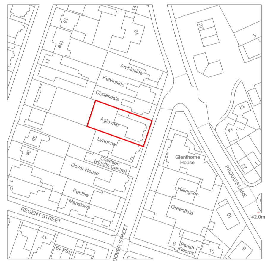
Location Plan 1 : 1250