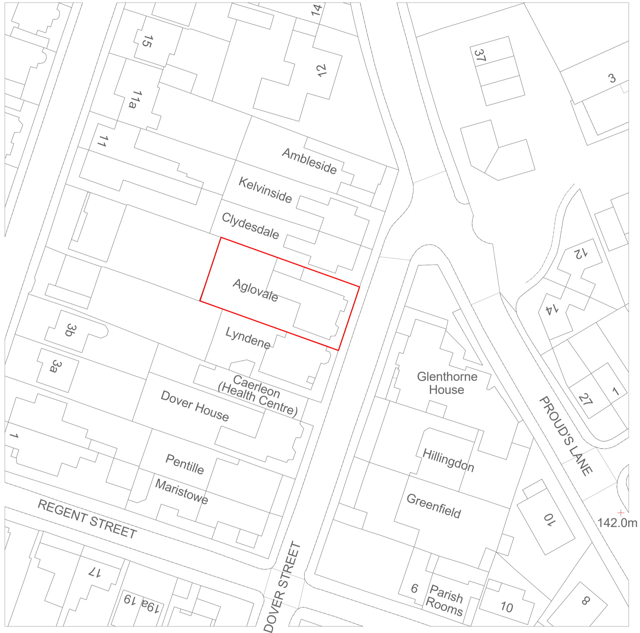
Block Plan 1 : 500