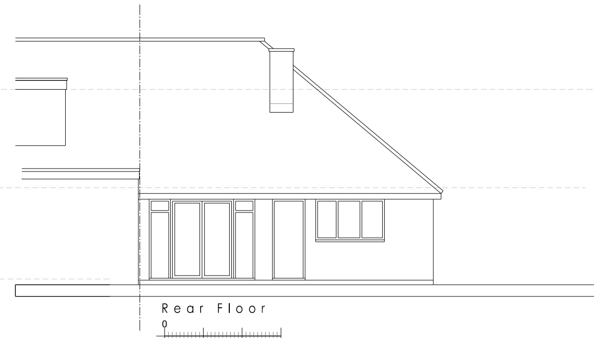
Rear Floor 0 1m 2 3 scale bar