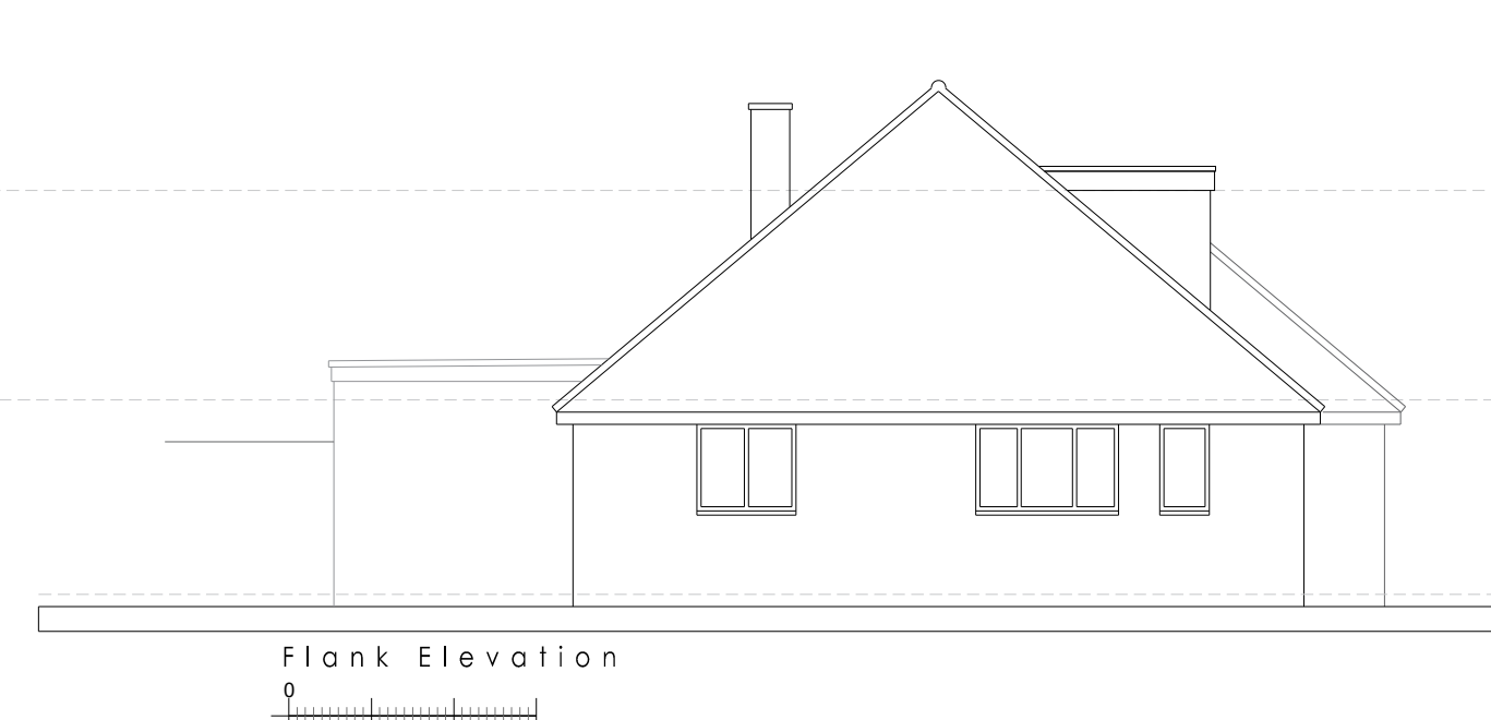
Flank Elevation 0 1m 2 3 scale bar