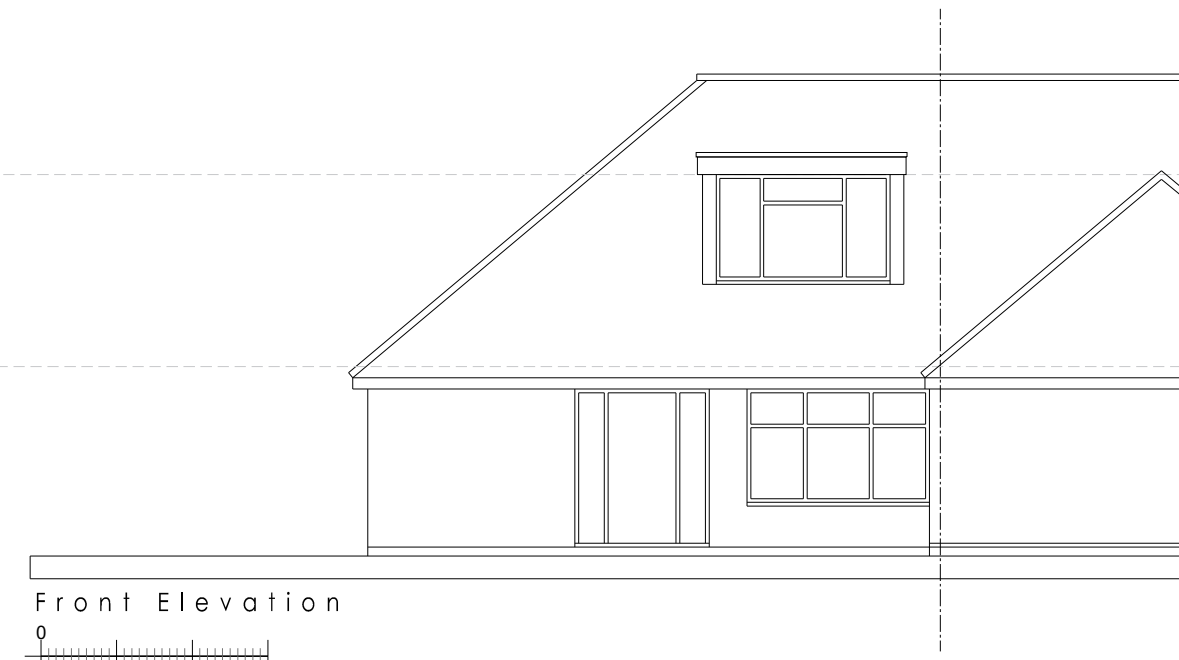
Front Elevation 0 1m 2 3 scale bar