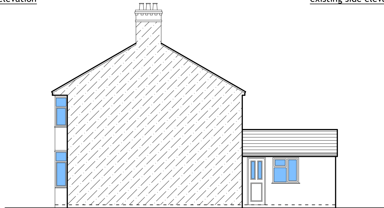
existing side elevation