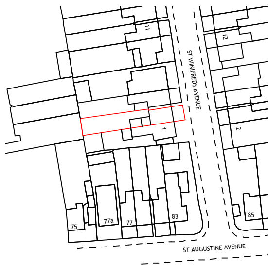
location plan scale 1:1250