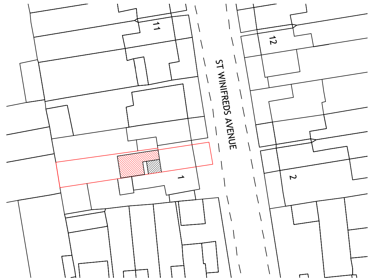
block plan scale 1:500