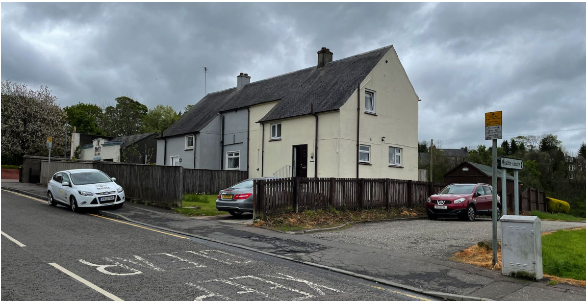
photo of house as existing