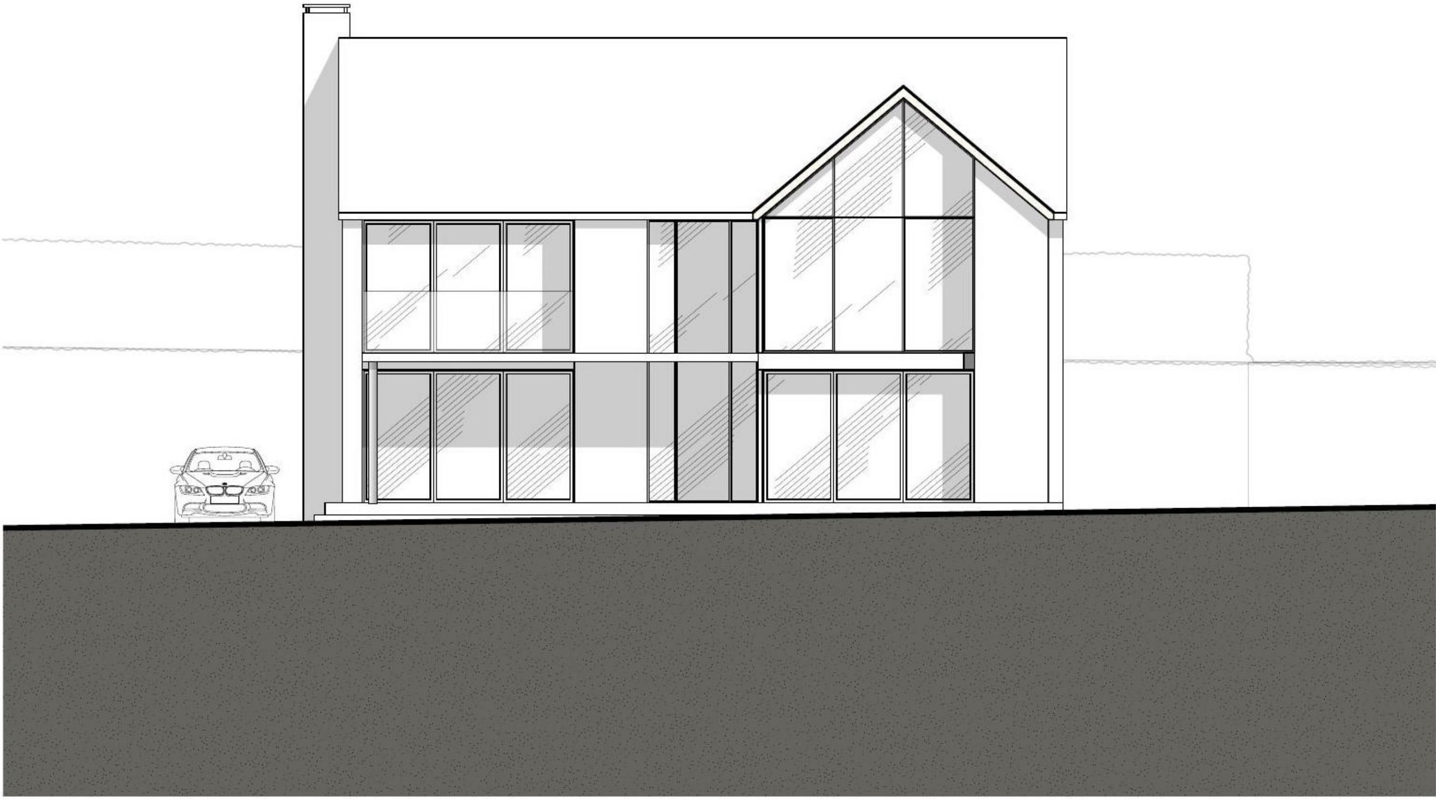
4 PROPOSED NORTH ELEVATION 1:500 @ A1