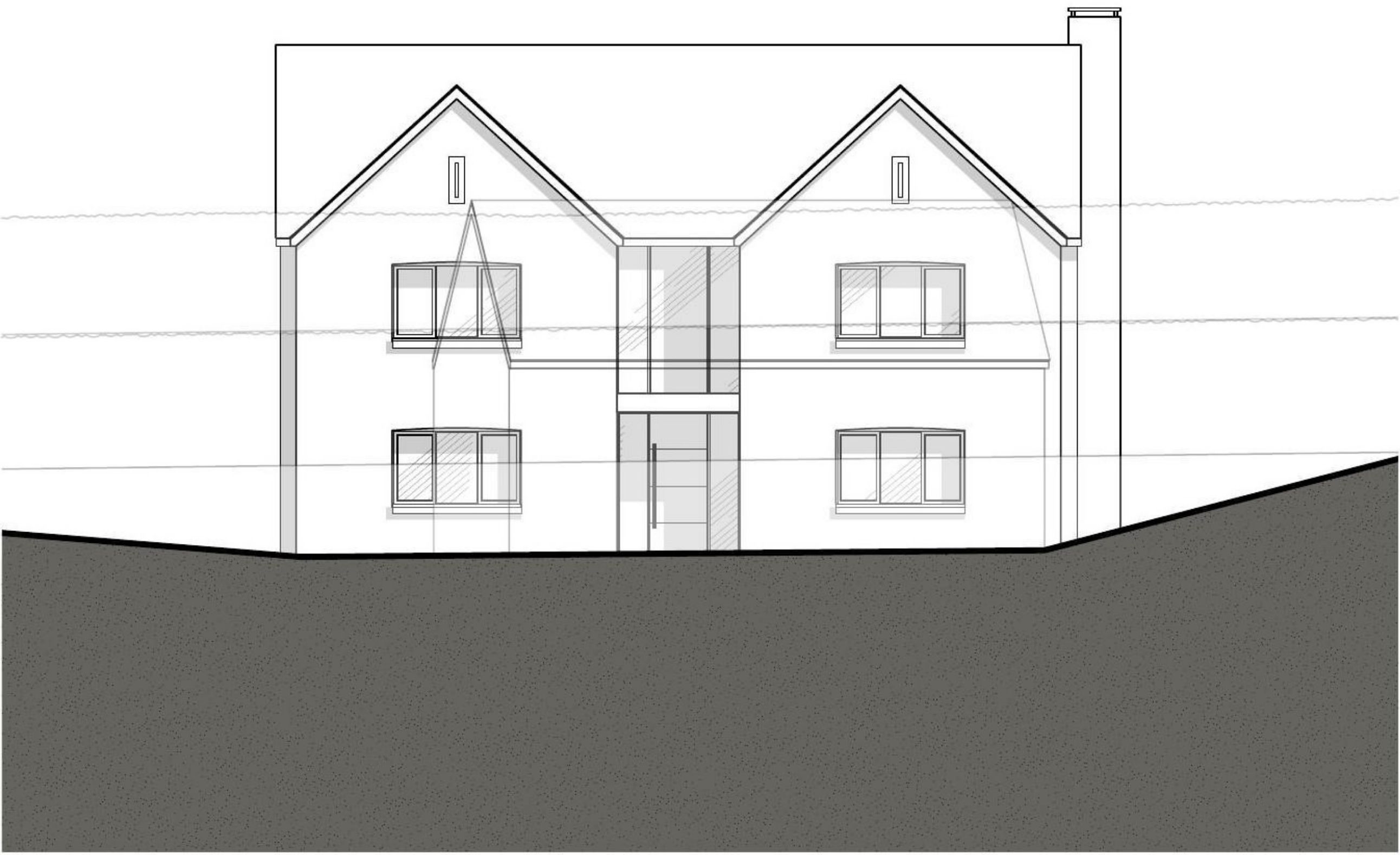
3 PROPOSED SOUTH ELEVATION 1:500 @ A1

PLEASE NOTE NO MANHOLES WERE LIFTED THROUGH SURVEYING THE PROPERTY. CONTRACTOR IS REQUIRED TO INSPECT DRAINAGE SYSTEM TO CHECK THEY WORK PRIOR TO COMMENCEMENT