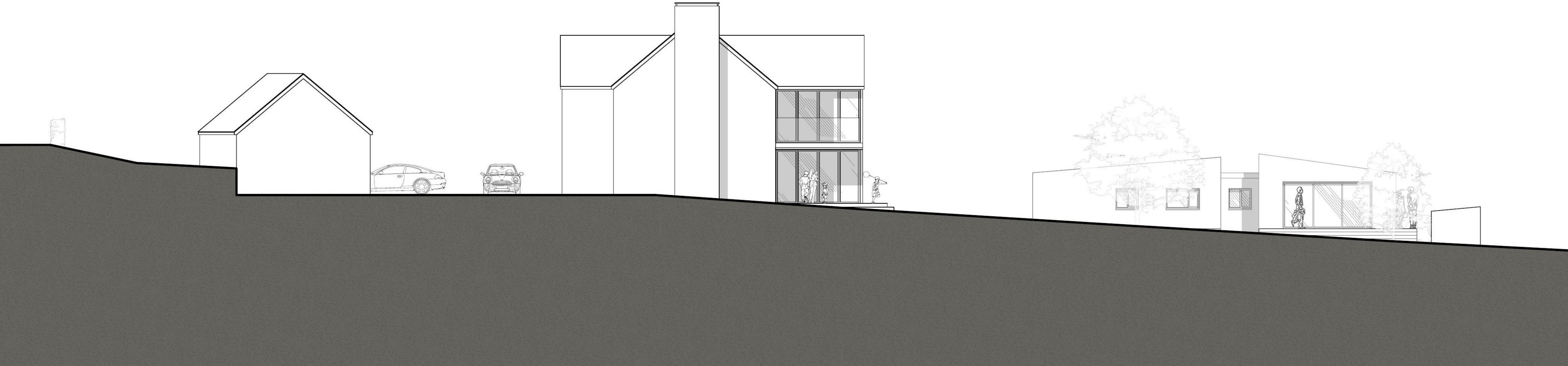
2 PROPOSED EAST ELEVATION 1:500 @ A1