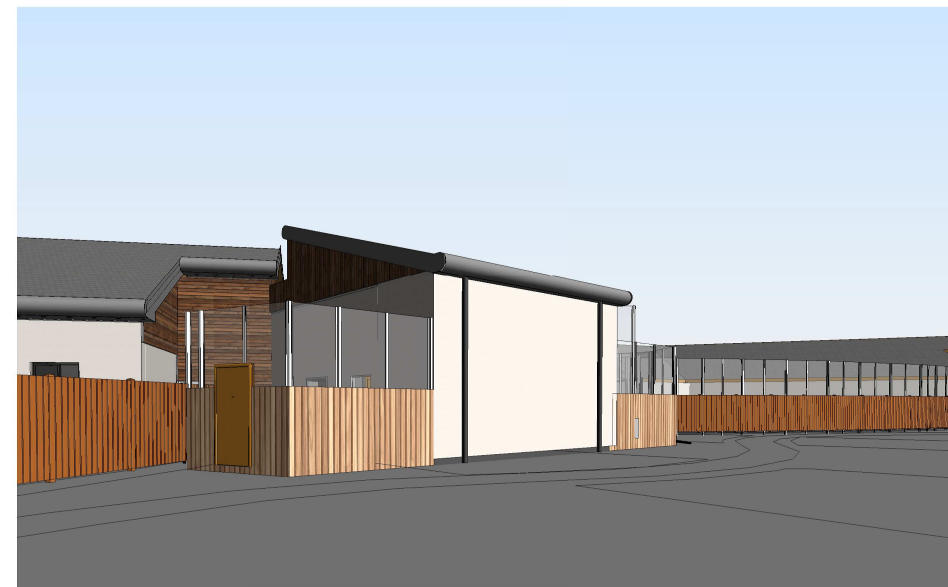
5 3D View 2