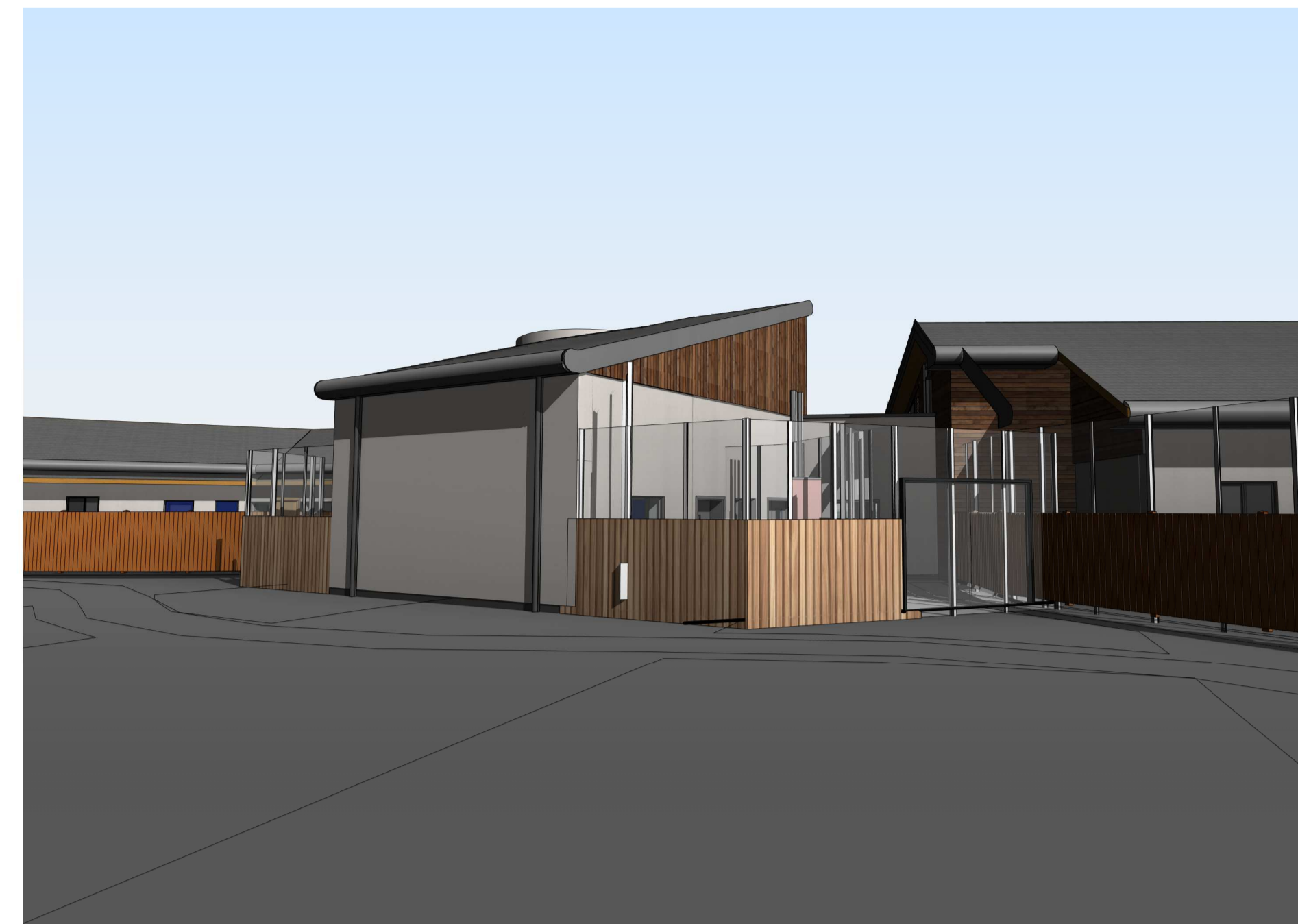
3 3D View 1