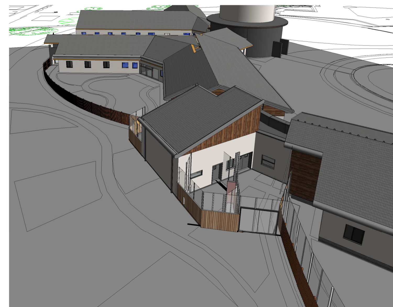
6 3D View 3

THIS DRAWING (OR ANY PART THEREOF) MAY NOT BE COPIED, TRANSMITTED OR DISCLOSED TO ANY THIRD PARTY OR UNAUTHORISED PERSON WITHOUT THE PRIOR WRITTEN PERMISSION OF GILLING DOD ARCHITECTS.