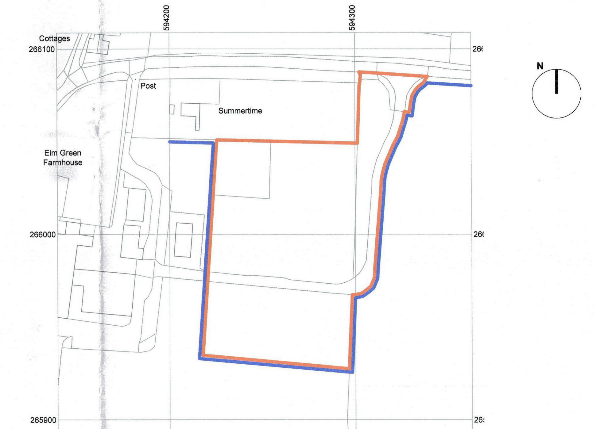
Location plan 1:1250