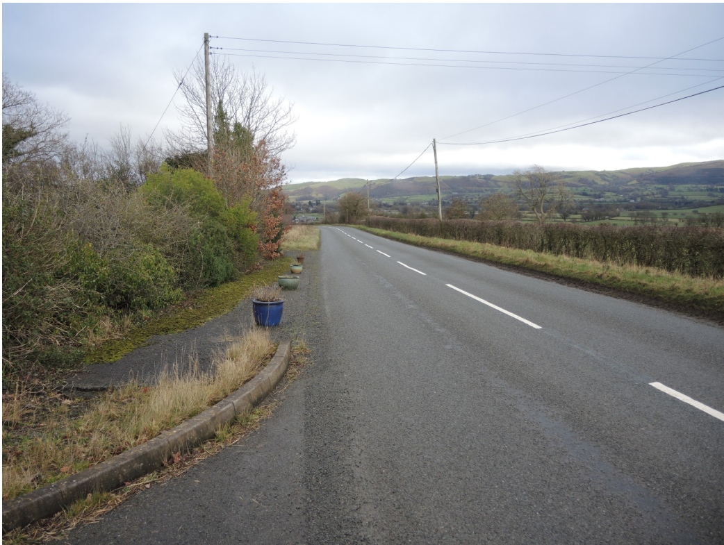
View from the existing entrance to Gate Farm along the B4569 towards Caersws (to the east)