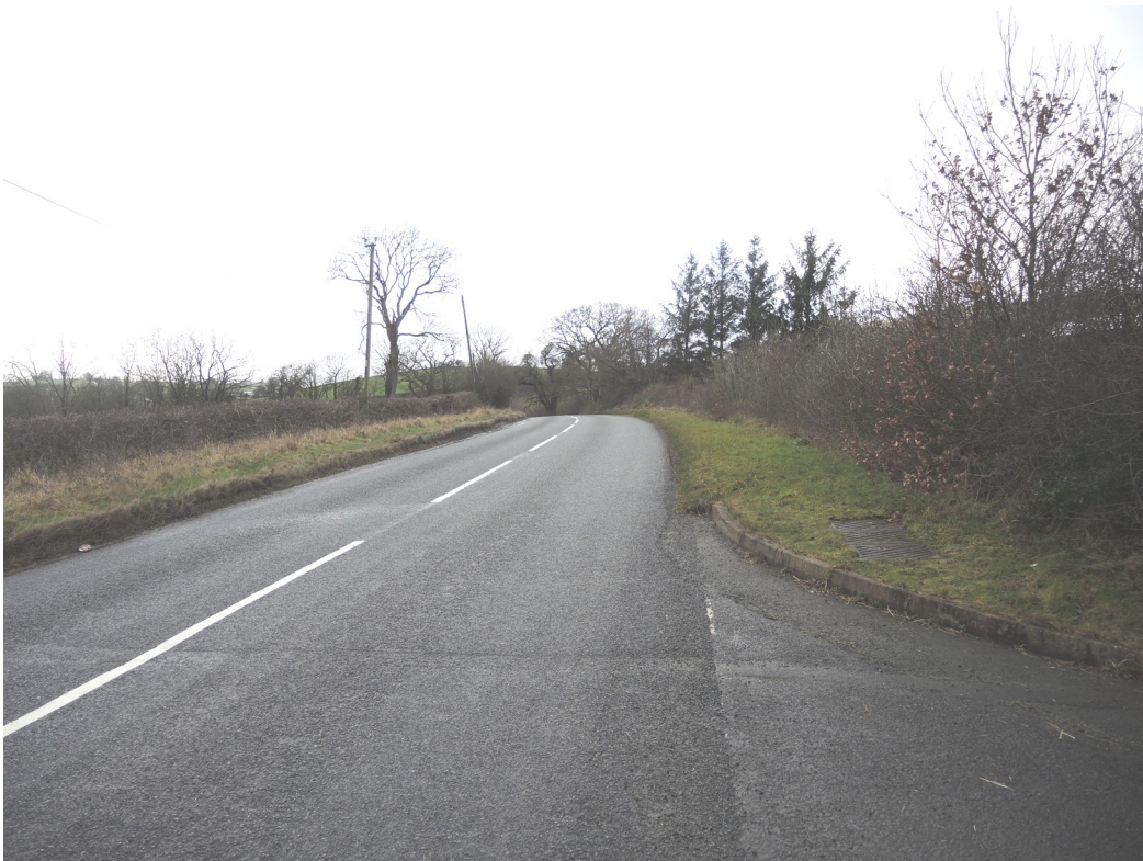
View from the existing entrance to Gate Farm along the B4569 towards Trefeglwys (to the west)