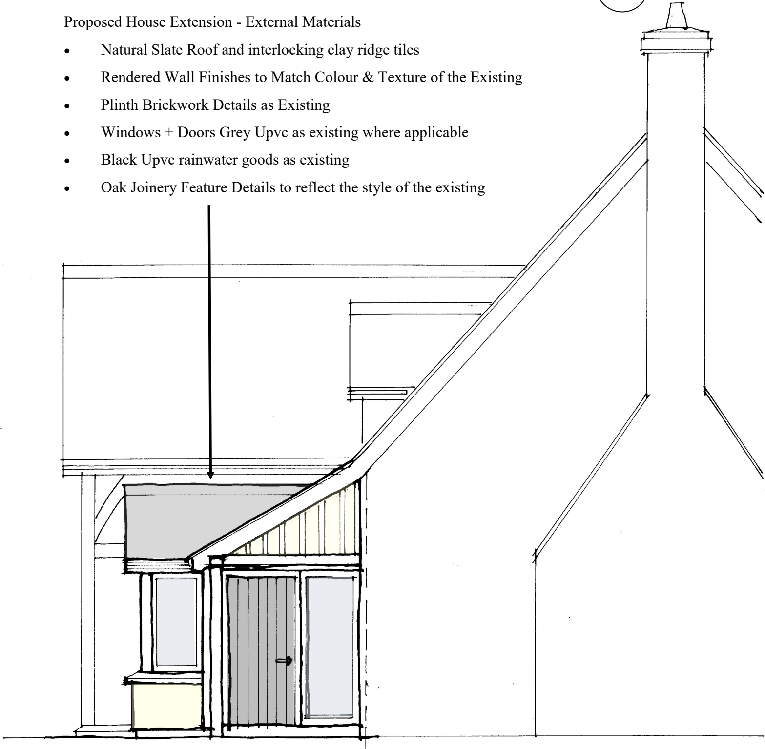
Proposed East Elevation