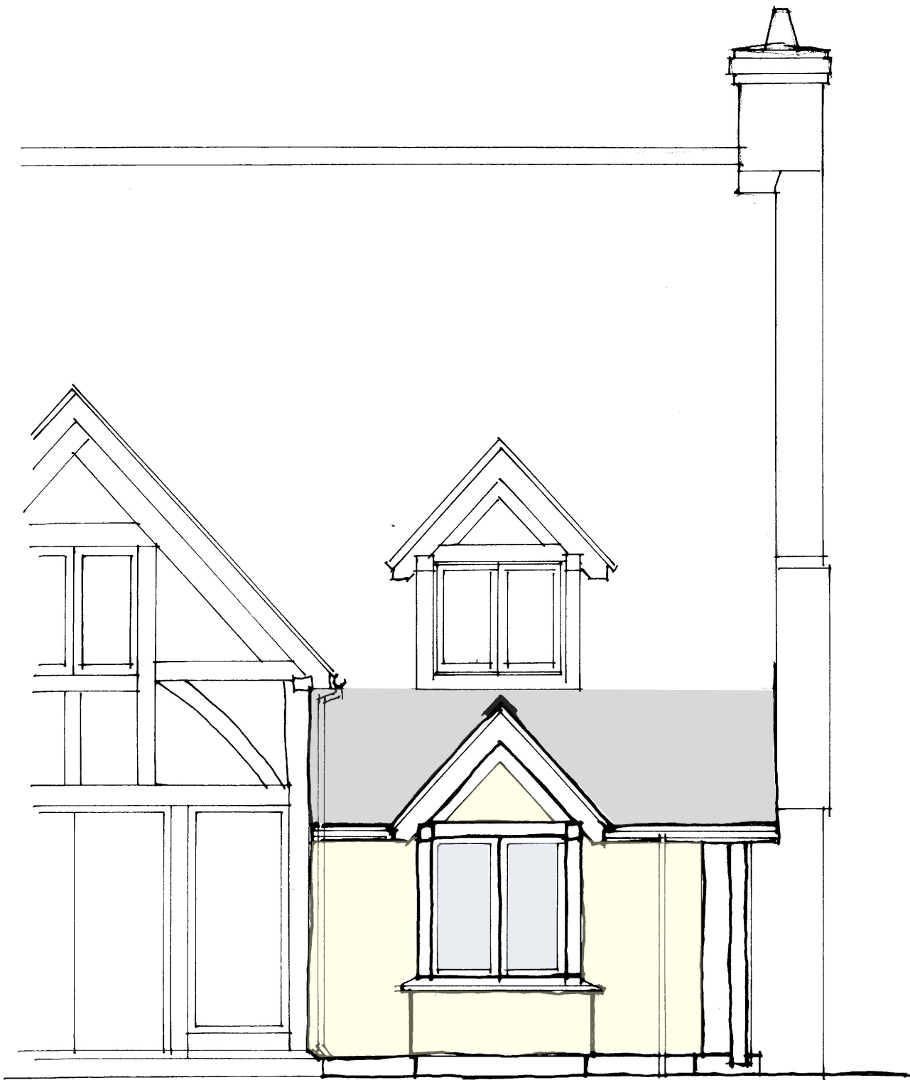
Proposed South Elevation