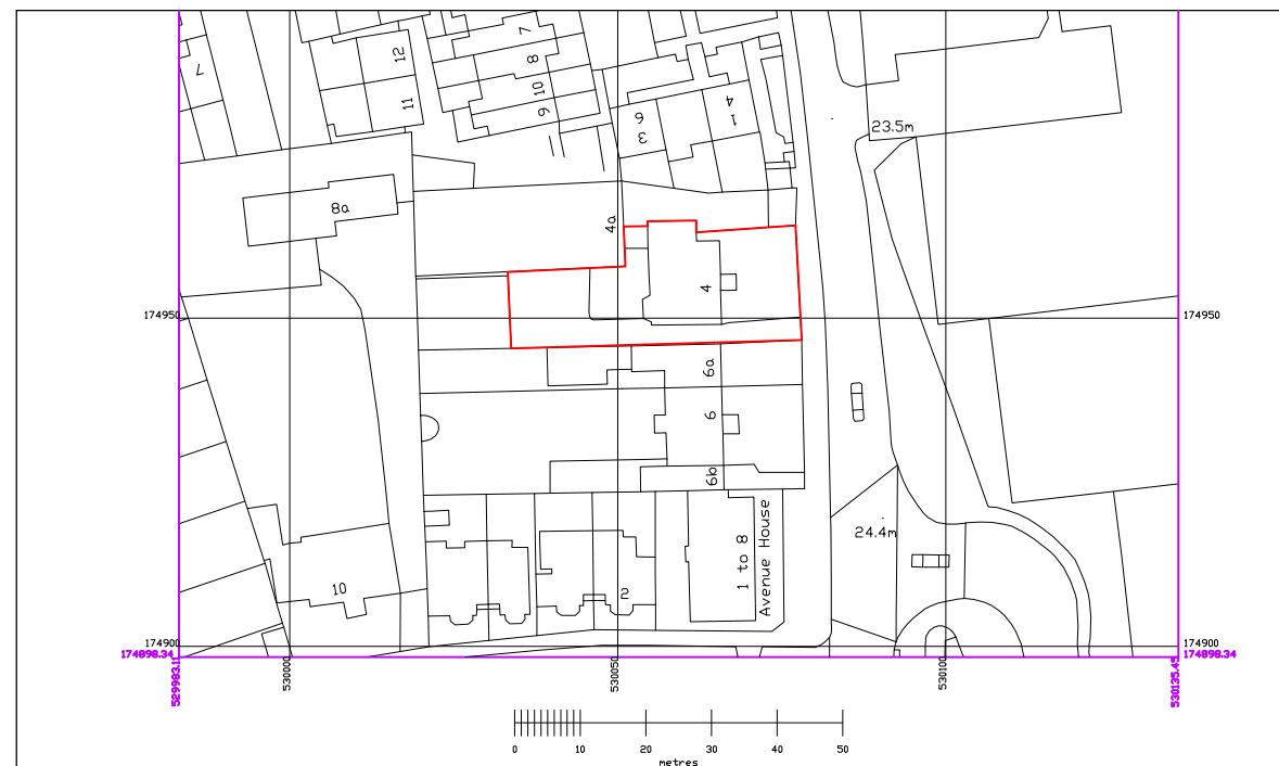
03 Location Plan 1:1250@A3