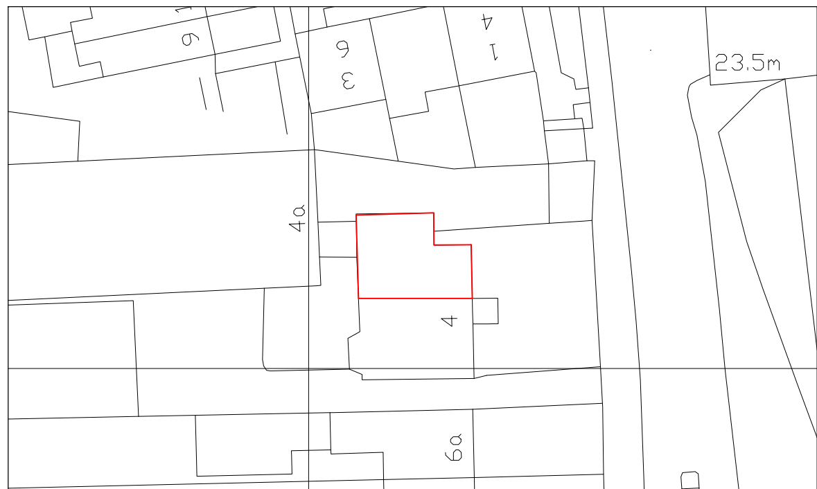
01 Block Plan Existing 1:500