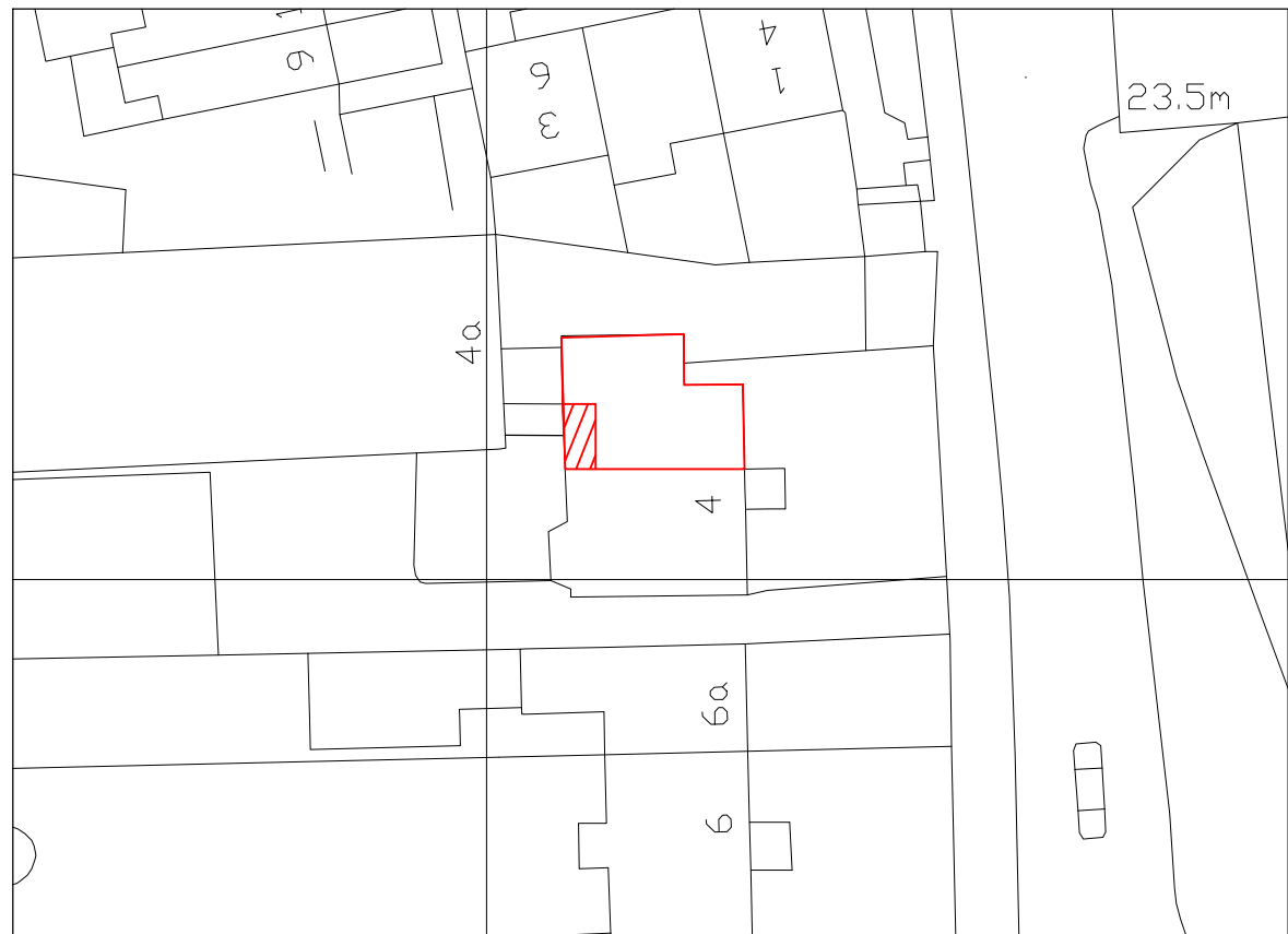
02 Block Plan Proposal 1:500