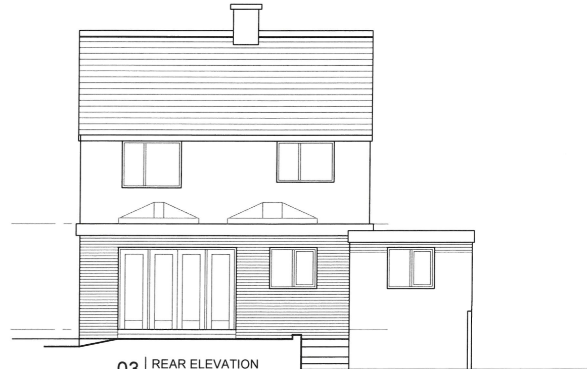
03 | REAR ELEVATION Scale 1:100