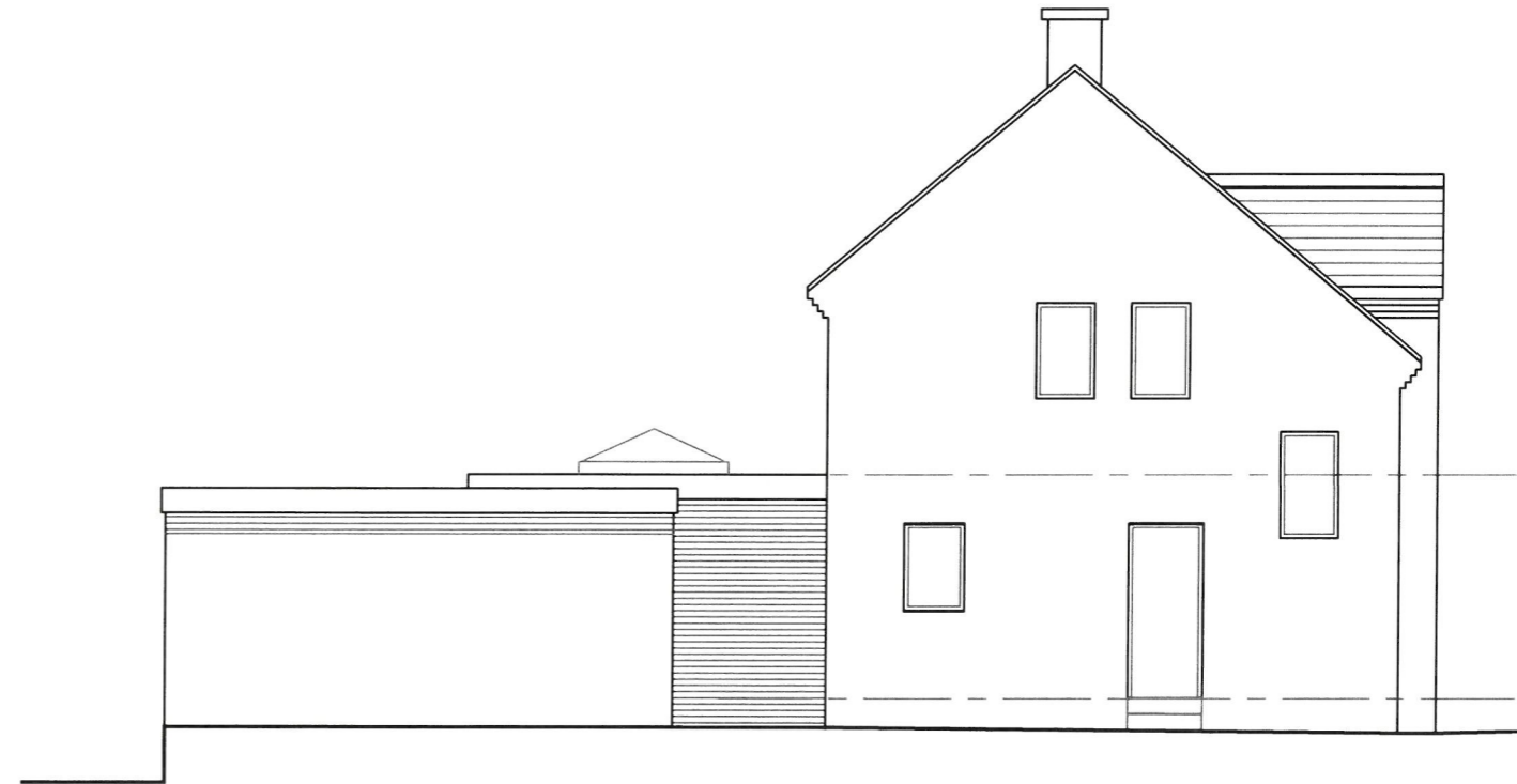
01 | SIDE ELEVATION Scale 1:100