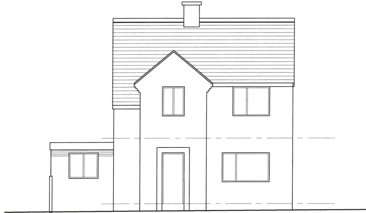
02 | FRONT ELEVATION Scale 1:100