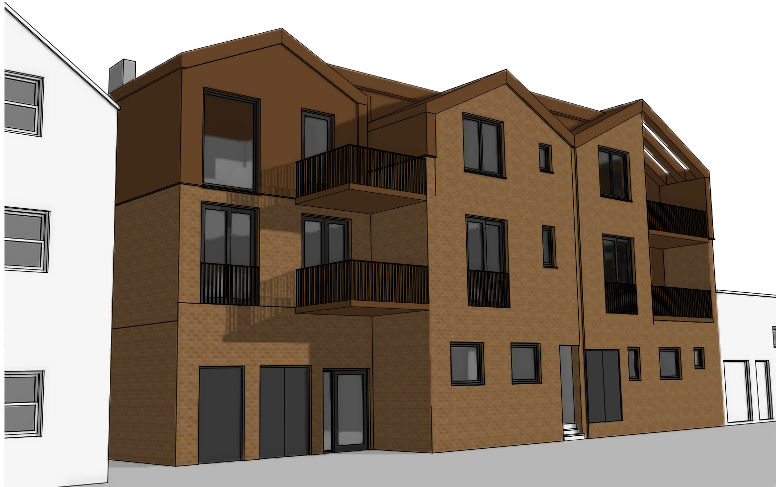
2 Left View