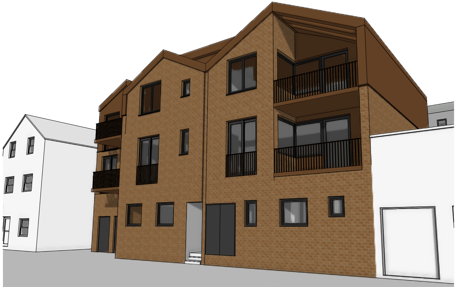
1 Right View