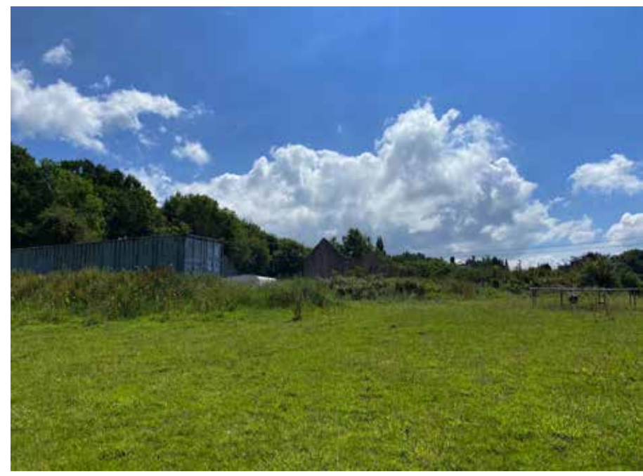
EXISTING CONTAINER TO BE DEMOLISHED