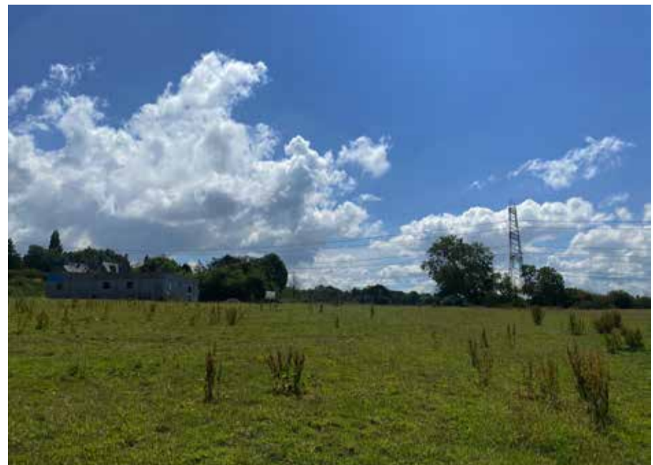
EXISTING DERELICT TO BE DEMOLISHED