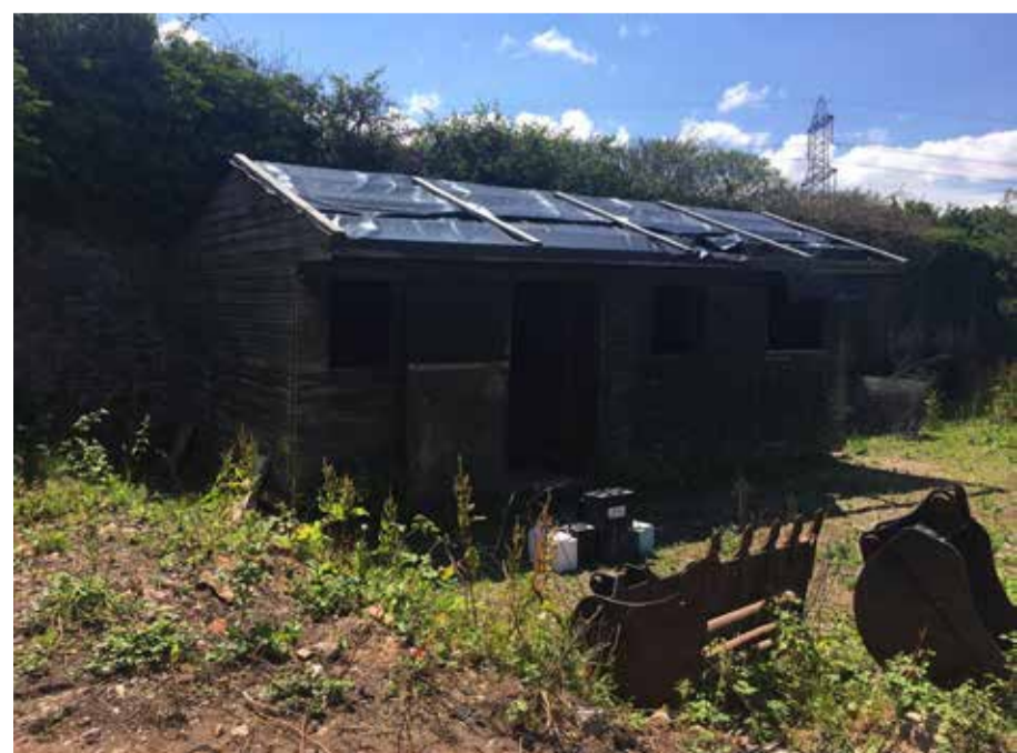
EXISTING STABLES/ CANOPY TO BE DEMOLISHED