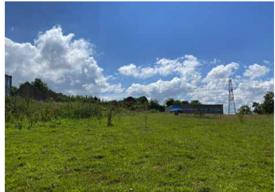
EXISTING STABLES/ CANOPY TO BE DEMOLISHED