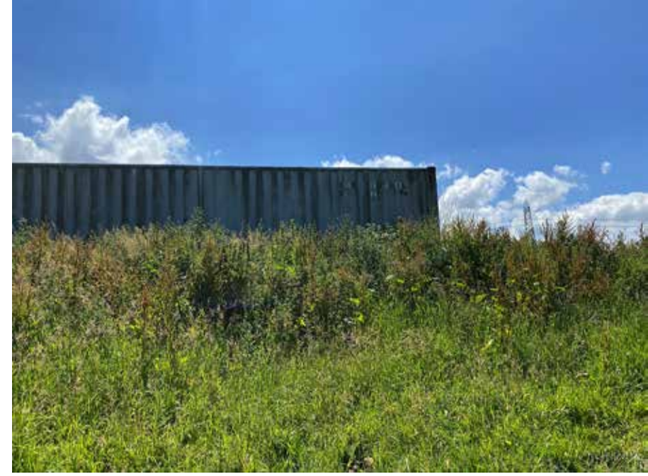
EXISTING CONTAINER TO BE DEMOLISHED