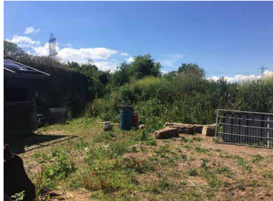
EXISTING STABLES/ CANOPY TO BE DEMOLISHED