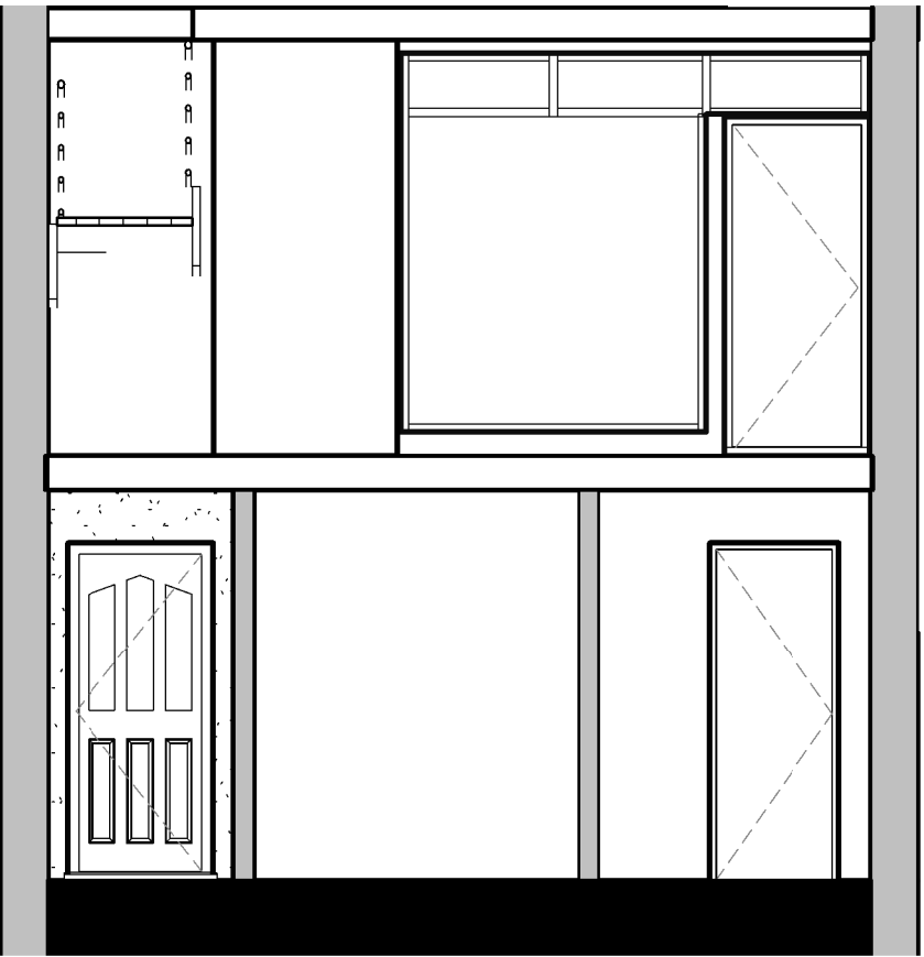
Existing - Section D-D 1 : 50