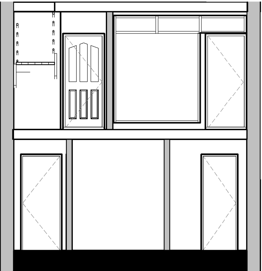
Proposed - Section D-D 1 : 50