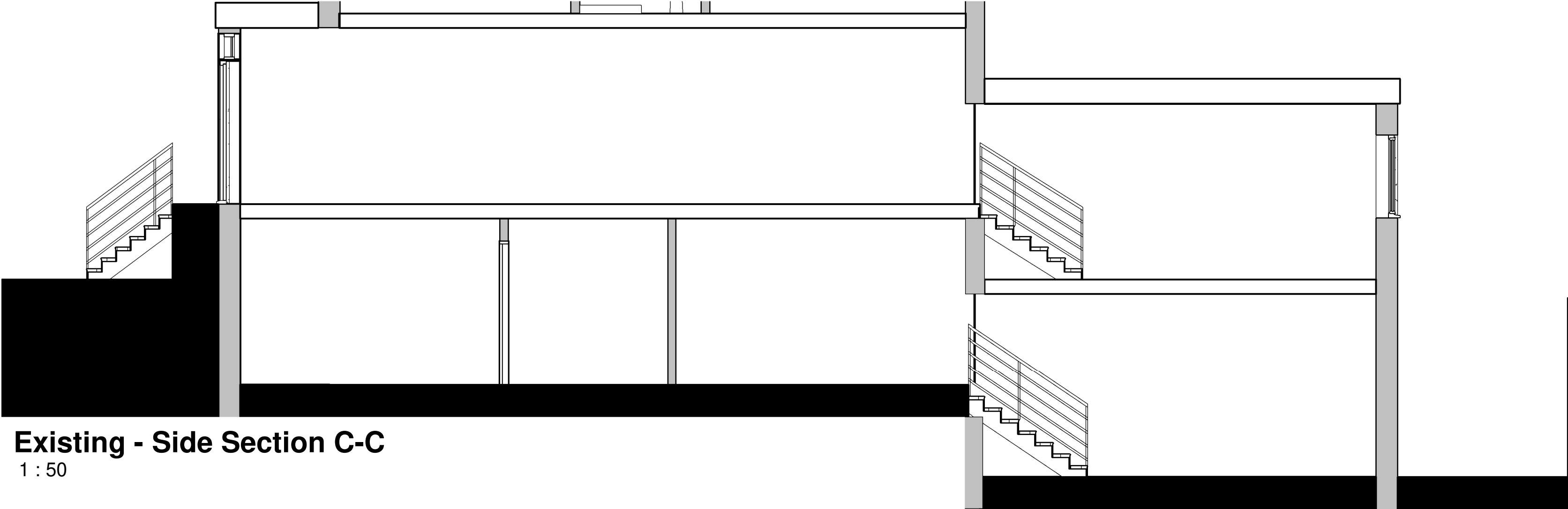
Existing - Side Section C-C 1 : 50