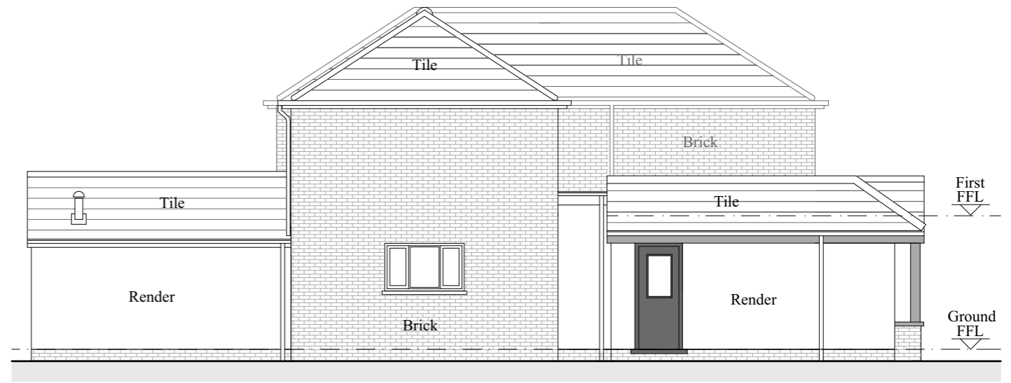
Proposed Side 2 Elevation