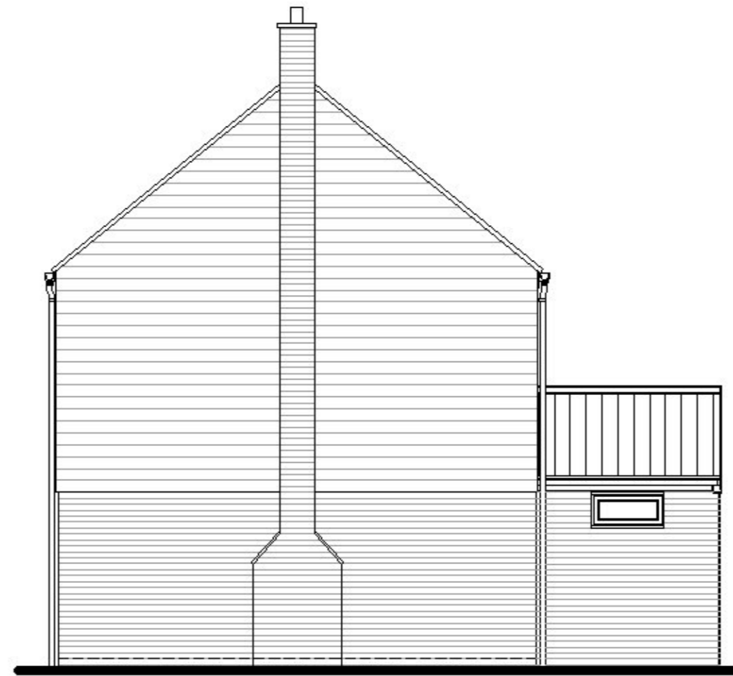
proposed north elevation