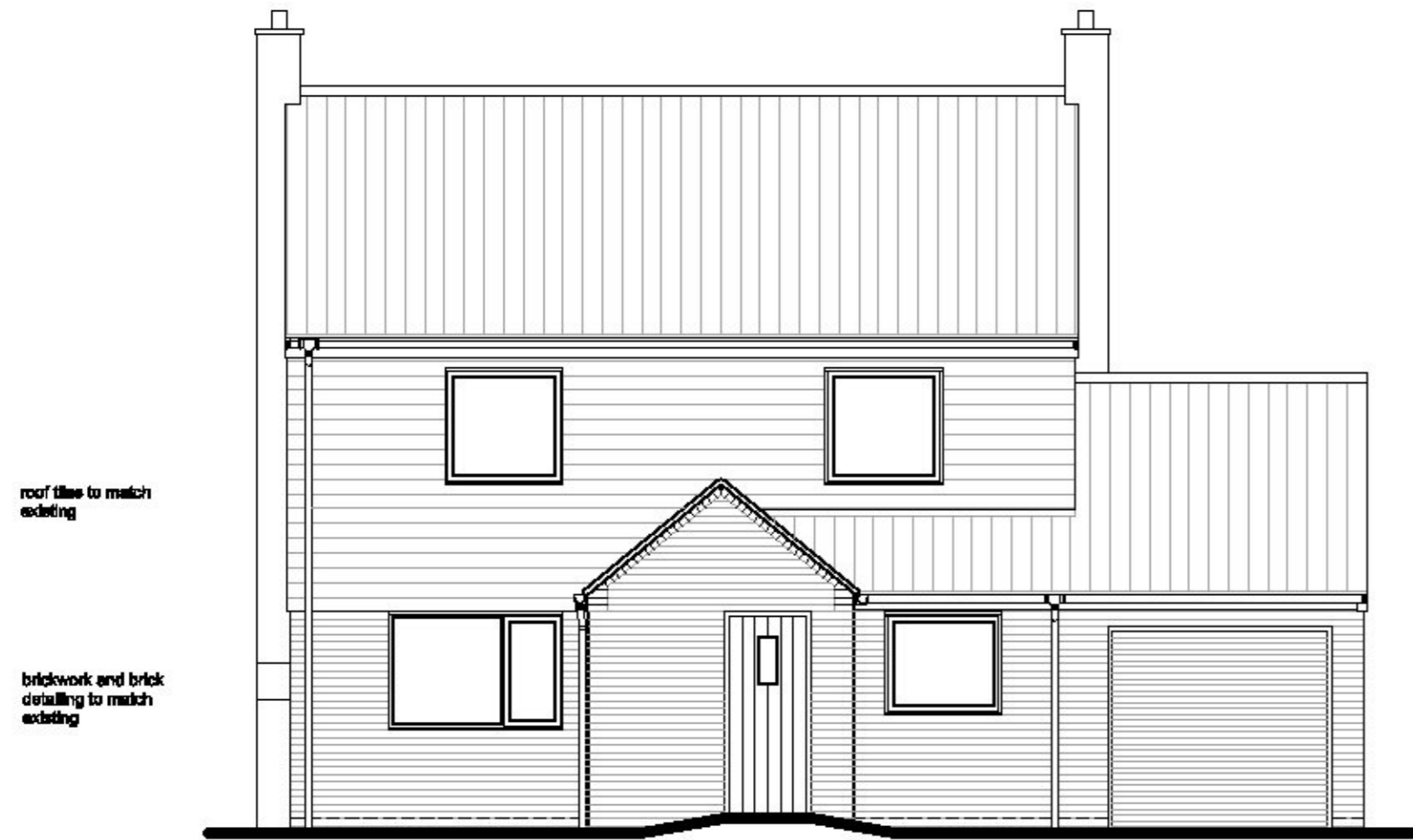
proposed west elevation