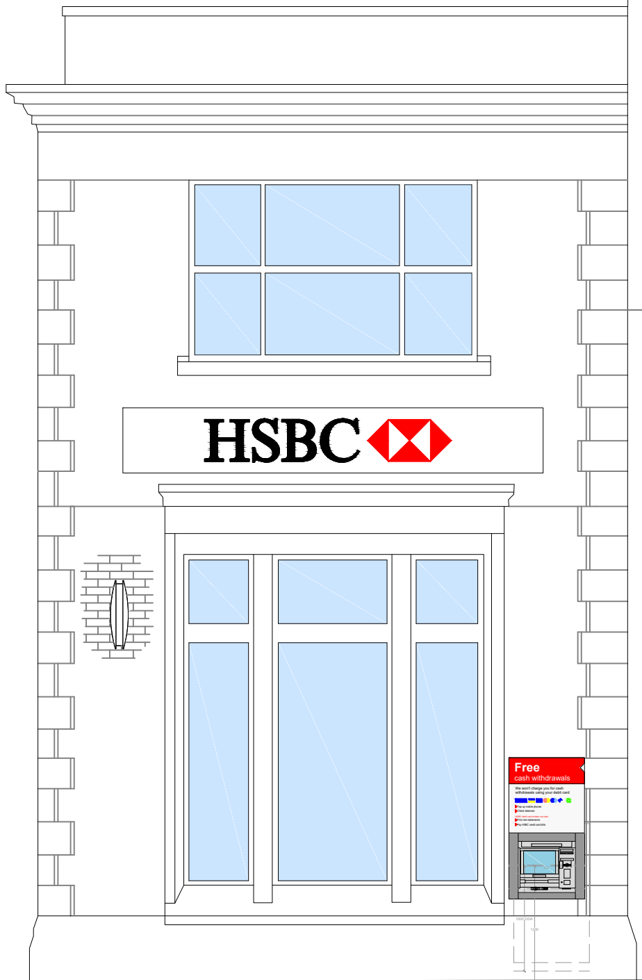
Church Road Elevation