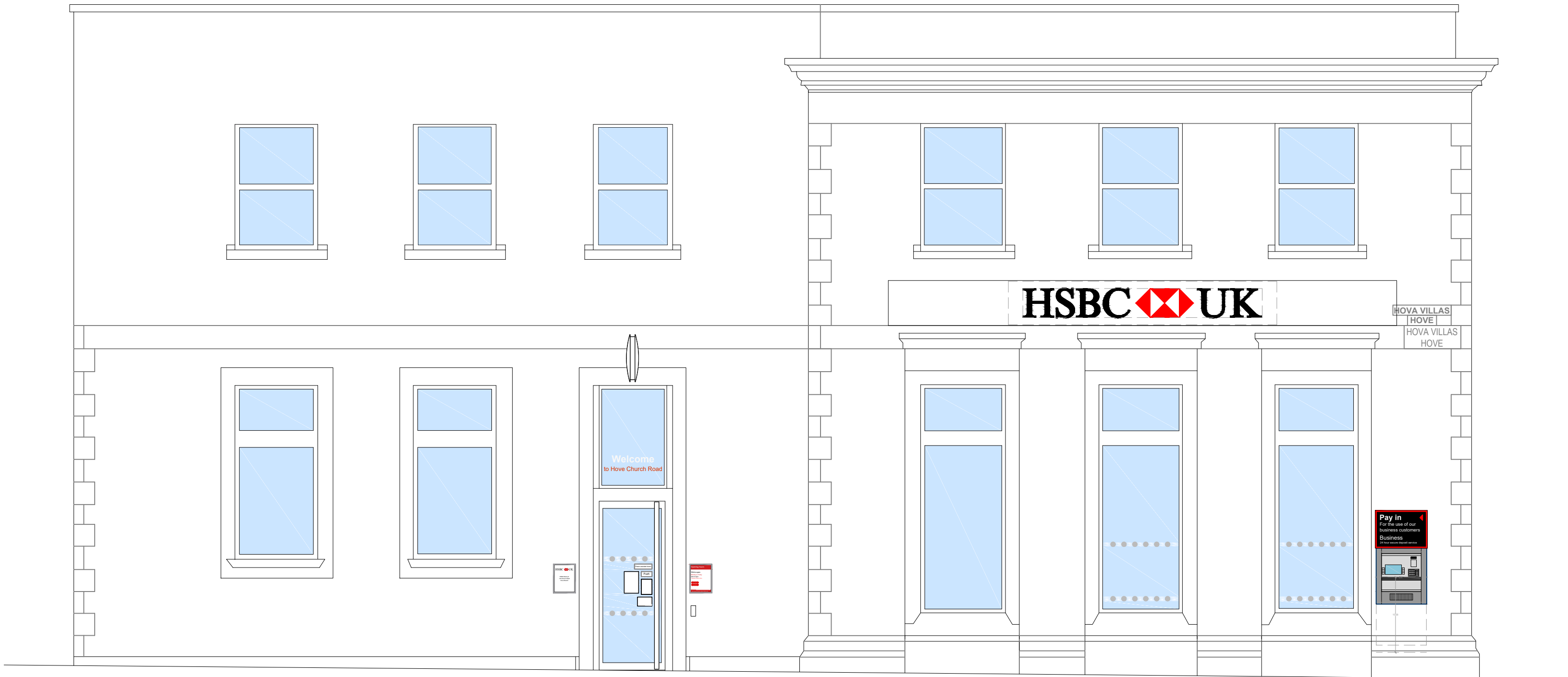
Hova Villas Elevation