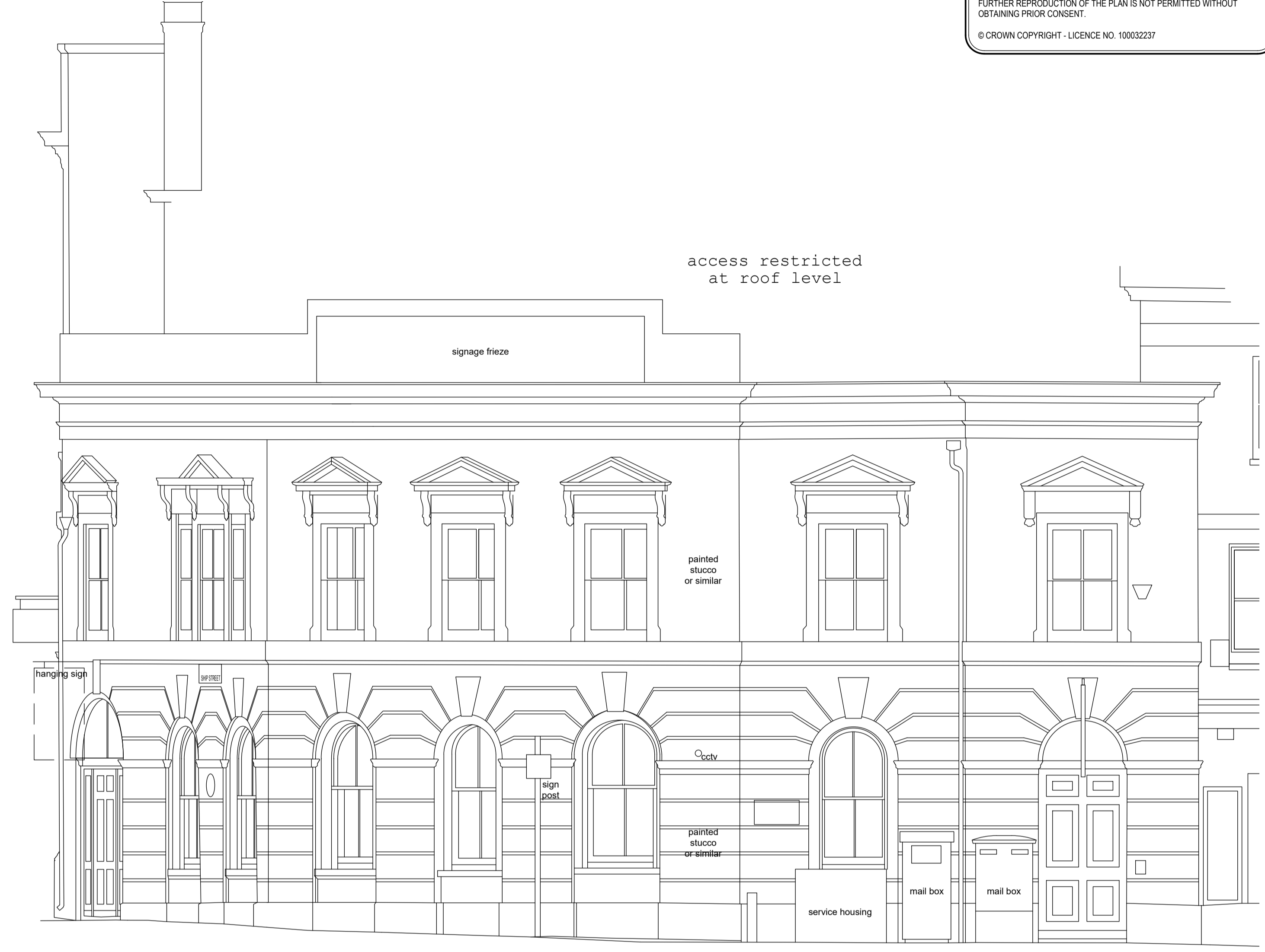
EXISTING EXTERNAL ELEVATION 2