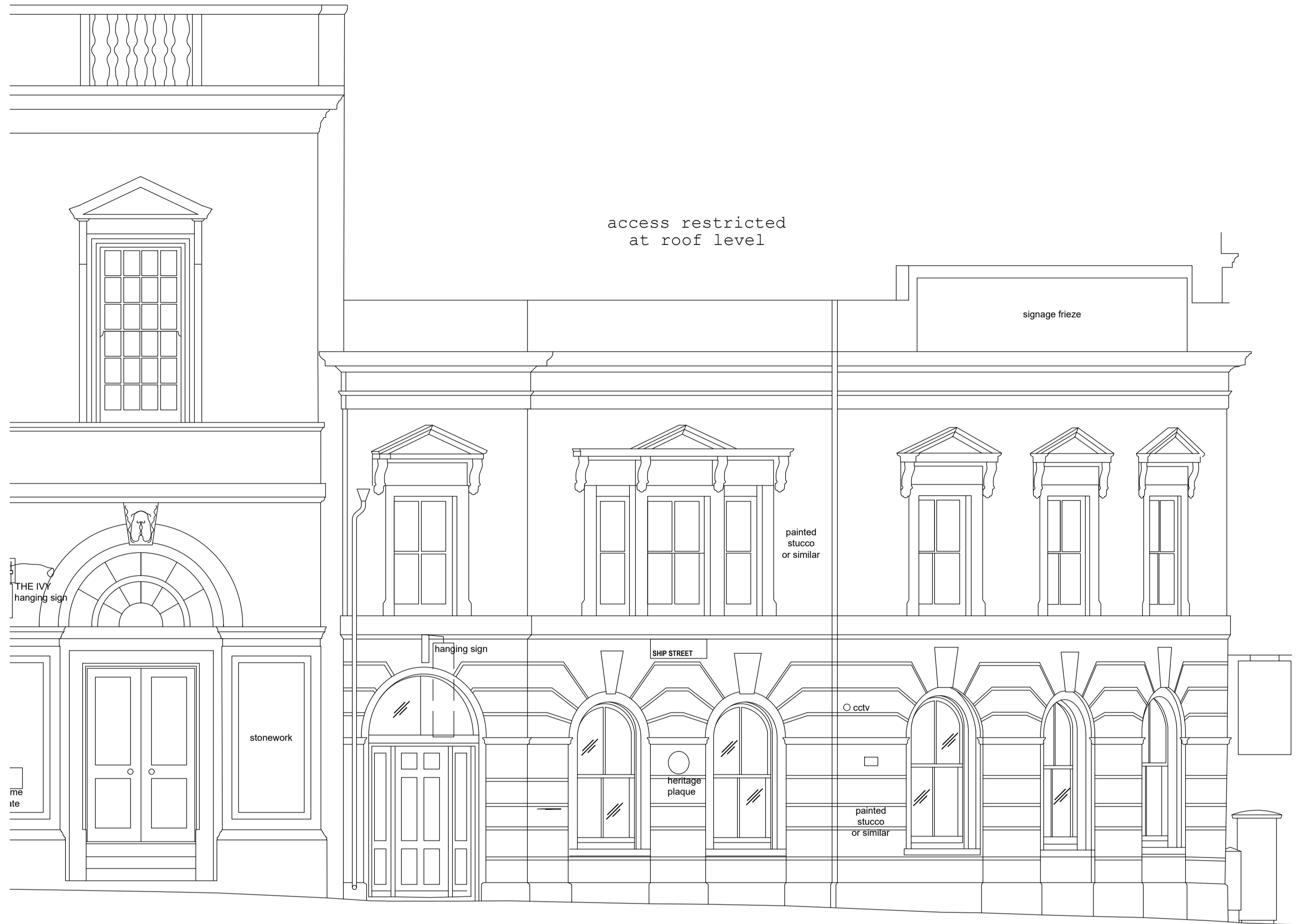
EXISTING EXTERNAL ELEVATION 1

GENERAL NOTES ALL DIMENSIONS TO BE CHECKED ON SITE PRIOR TO COMMENCEMENT OF WORKS - PLEASE REPORT ERRORS OR OMISSIONS TO THE ARCHITECT. THIS DRAWING HAS BEEN PRODUCED FOR THE PURPOSES OF PLANNING AND BUILDING REGULATIONS APPROVALS ONLY AND IS NOT INTENDED TO BE A FULL WORKING DRAWING. THIS DRAWING IS TO BE READ IN CONJUNCTION WITH ANY WRITTEN SPECIFICATIONS, SCHEDULES OF WORK AND STRUCTURAL ENGINEER'S DETAILS AS APPROPRIATE. THIS DRAWING IS THE COPYRIGHT OF PUMP HOUSE DESIGNS AND ANY FURTHER REPRODUCTION OF THE PLAN IS NOT PERMITTED WITHOUT OBTAINING PRIOR CONSENT. © CROWN COPYRIGHT - LICENCE NO. 100032237