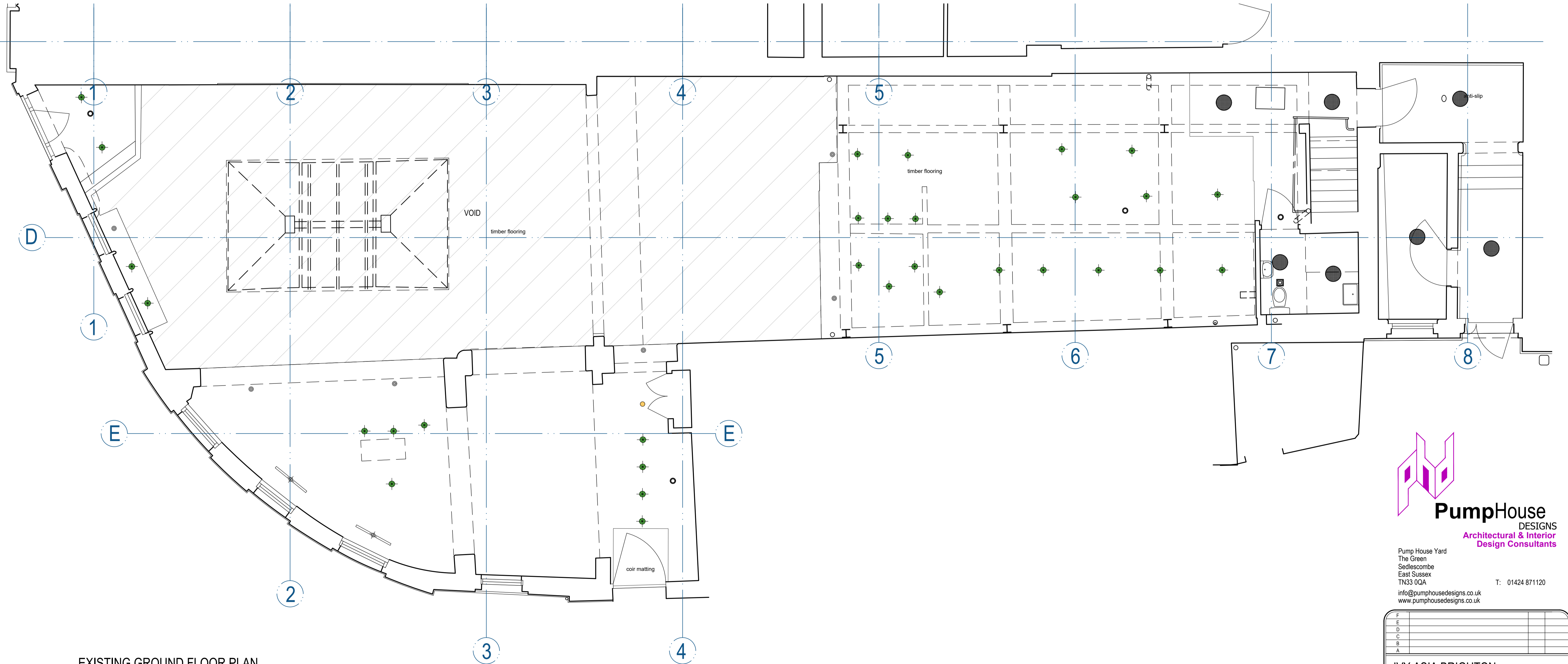
EXISTING GROUND FLOOR PLAN SCALE 1:50 @ A1