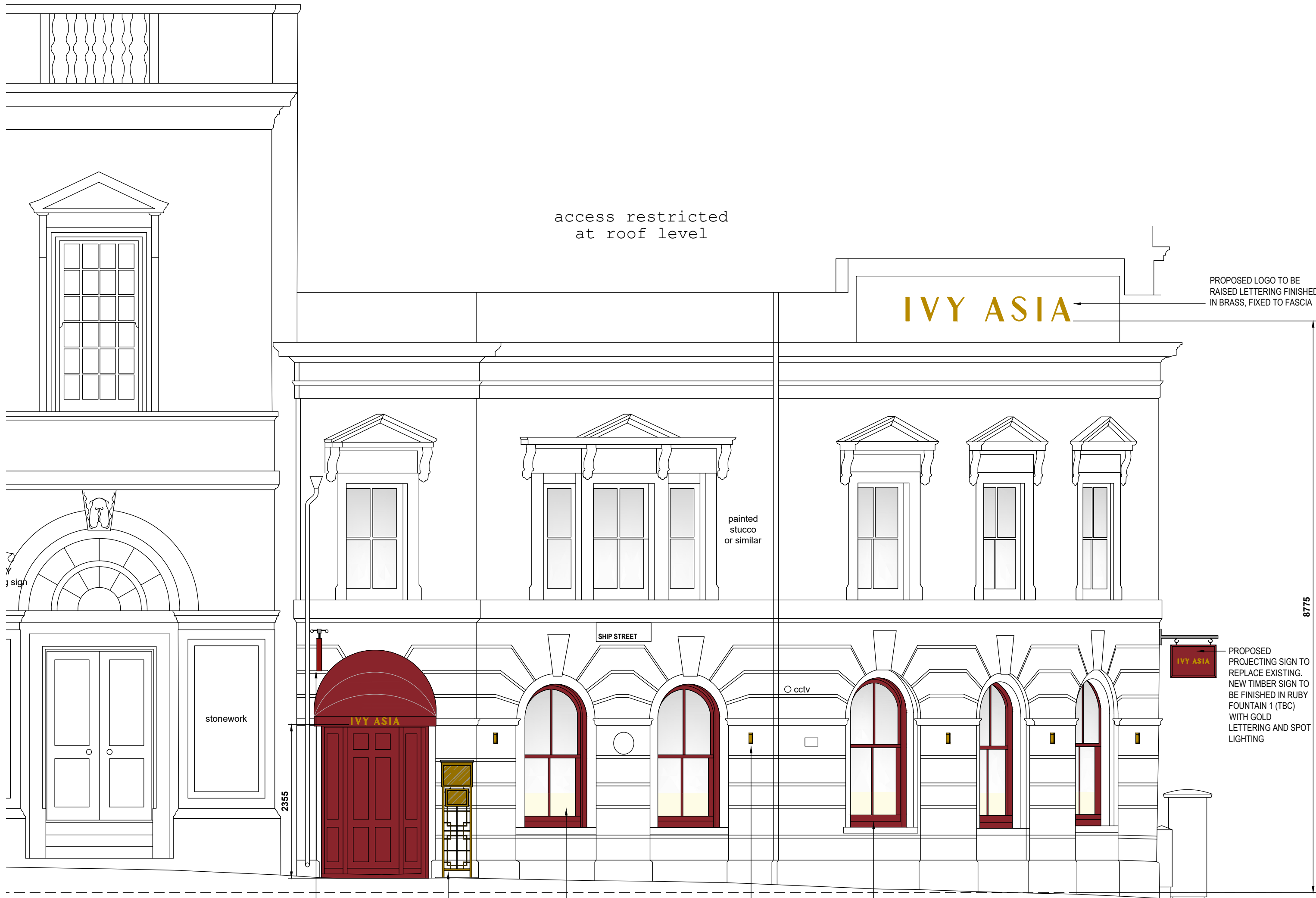
PROPOSED EXTERNAL ELEVATION 1

GENERAL NOTES ALL DIMENSIONS TO BE CHECKED ON SITE PRIOR TO COMMENCEMENT OF WORKS - PLEASE REPORT ERRORS OR OMISSIONS TO THE ARCHITECT. THIS DRAWING HAS BEEN PRODUCED FOR THE PURPOSES OF PLANNING AND BUILDING REGULATIONS APPROVALS ONLY AND IS NOT INTENDED TO BE A FULL WORKING DRAWING. THIS DRAWING IS TO BE READ IN CONJUNCTION WITH ANY WRITTEN SPECIFICATIONS, SCHEDULES OF WORK AND STRUCTURAL ENGINEERS DETAILS AS APPROPRIATE. THIS DRAWING IS THE COPYRIGHT OF PUMP HOUSE DESIGNS AND ANY FURTHER REPRODUCTION OF THE PLAN IS NOT PERMITTED WITHOUT OBTAINING PRIOR CONSENT. © CROWN COPYRIGHT - LICENCE NO. 100032237