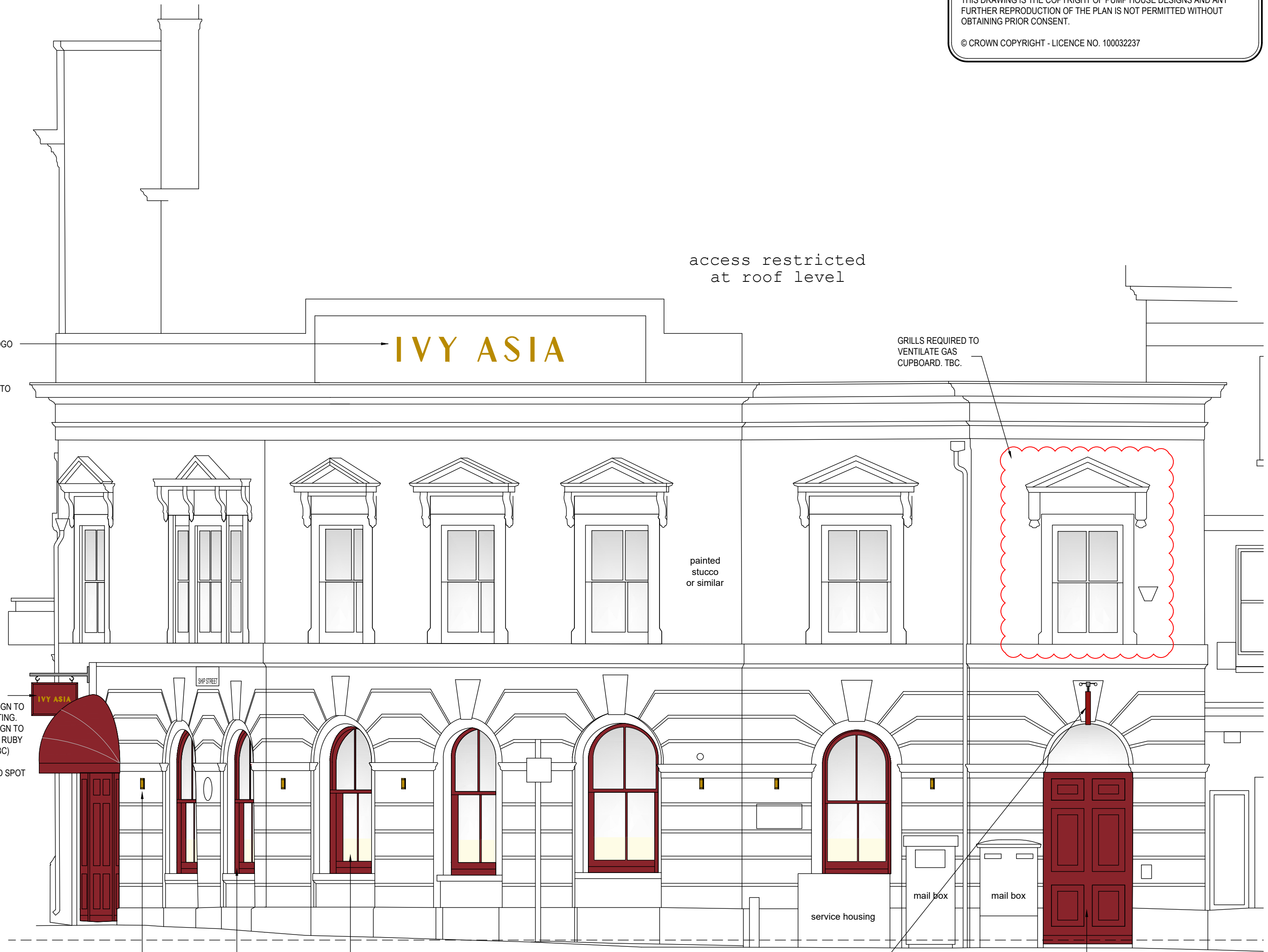
PROPOSED EXTERNAL ELEVATION 2