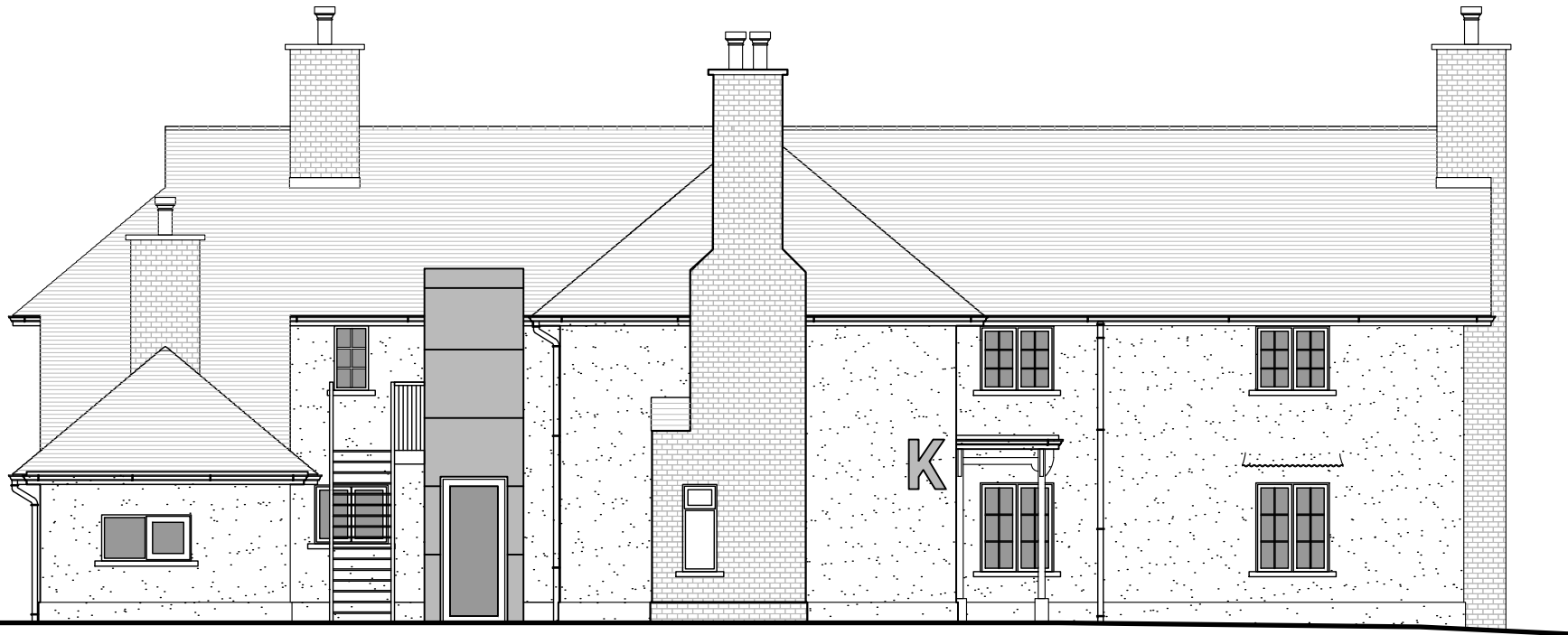
ELEVATION A | AS PROPOSED