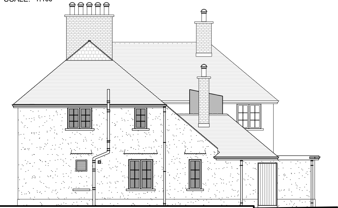
ELEVATION B | AS PROPOSED