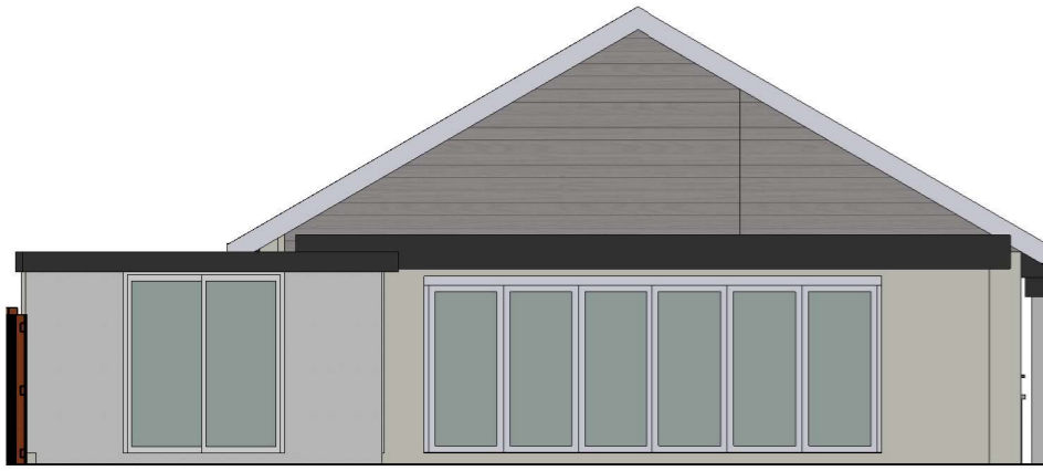
1 East Elevation 1 : 100