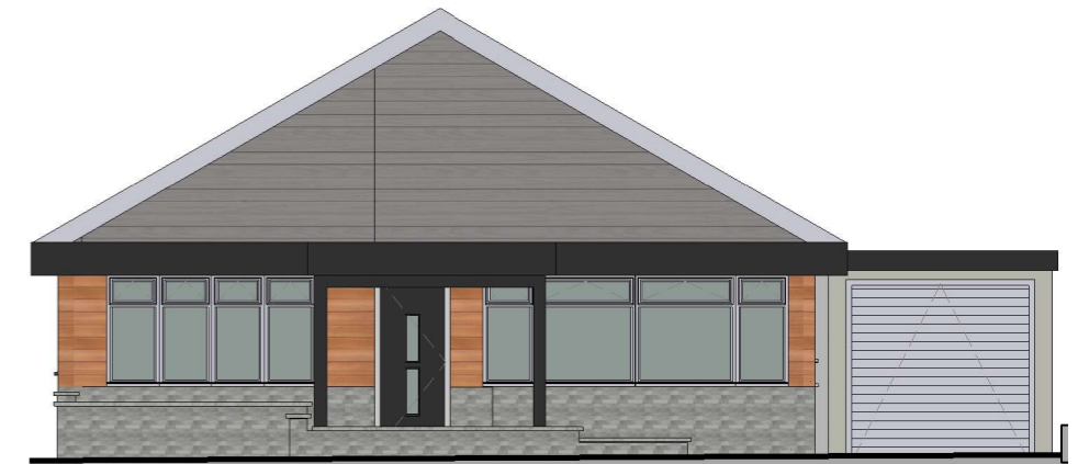
4 West Elevation 1 : 100