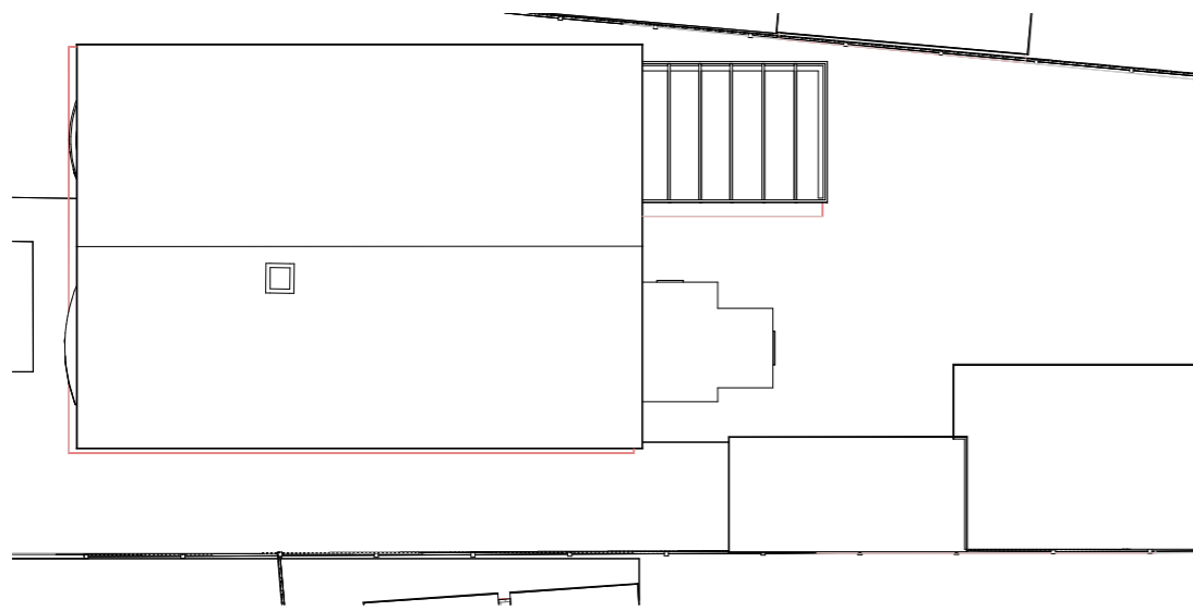
3 Roof Plan 1 : 200