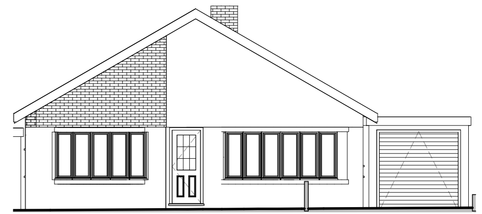
4 West Elevation 1 : 100