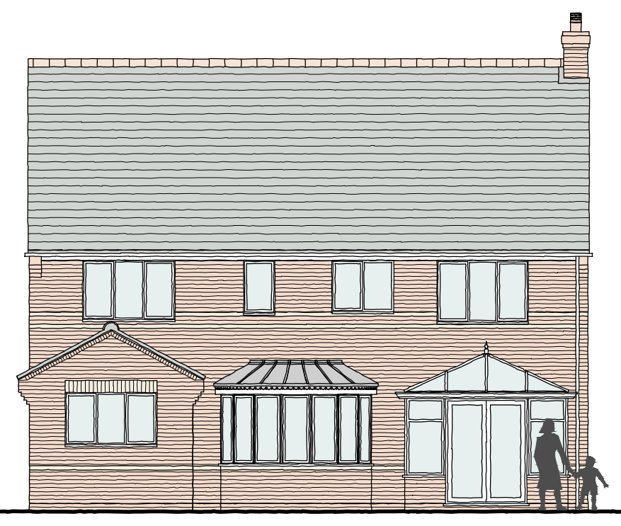
Rear se Elevation 1:100