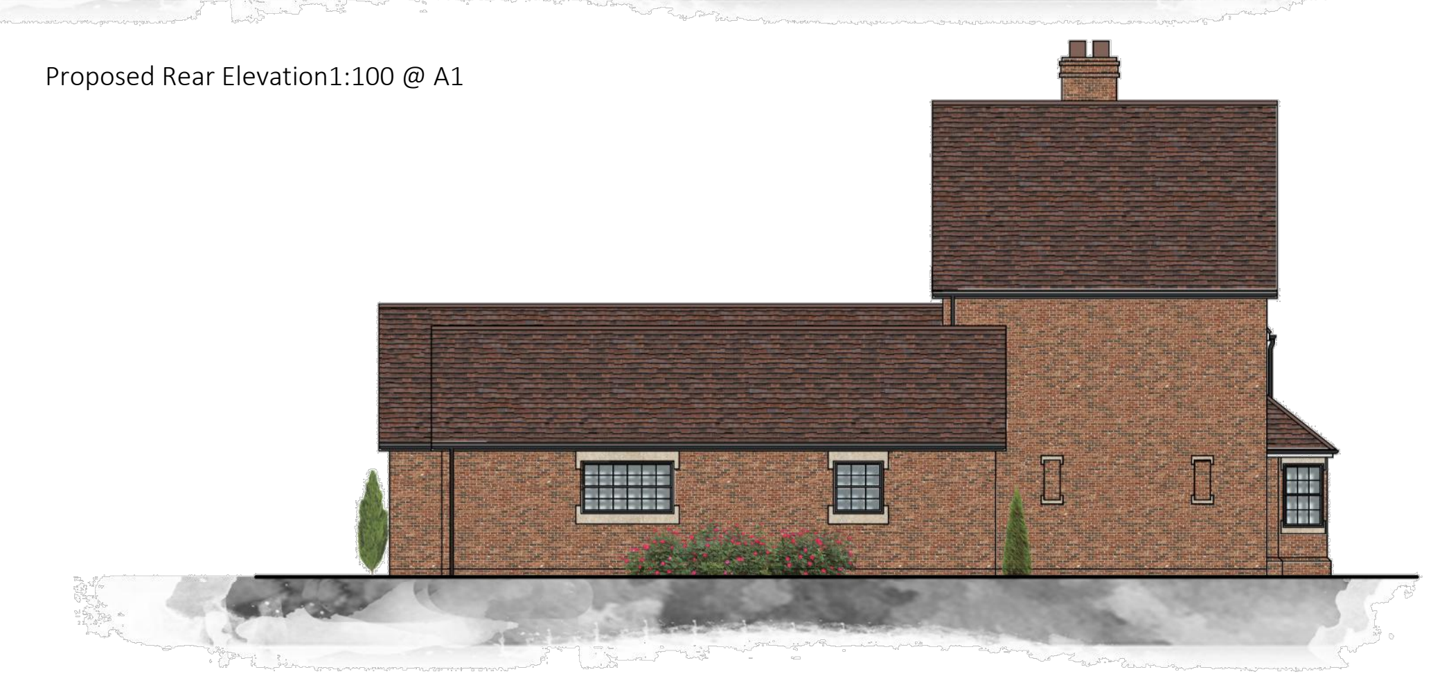
Proposed Side Elevation1:100 @ A1