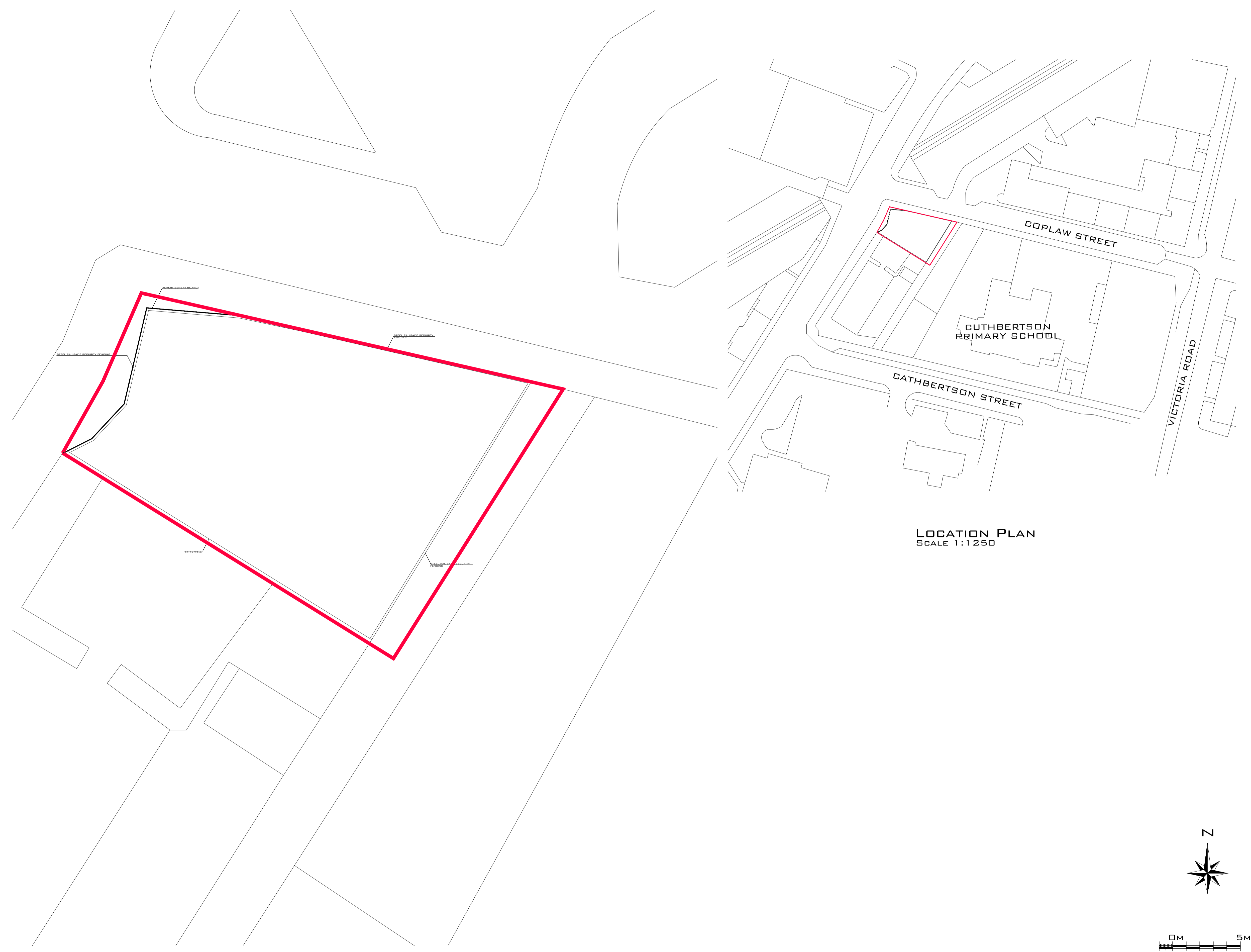
BLOCK PLAN SCALE 1:200