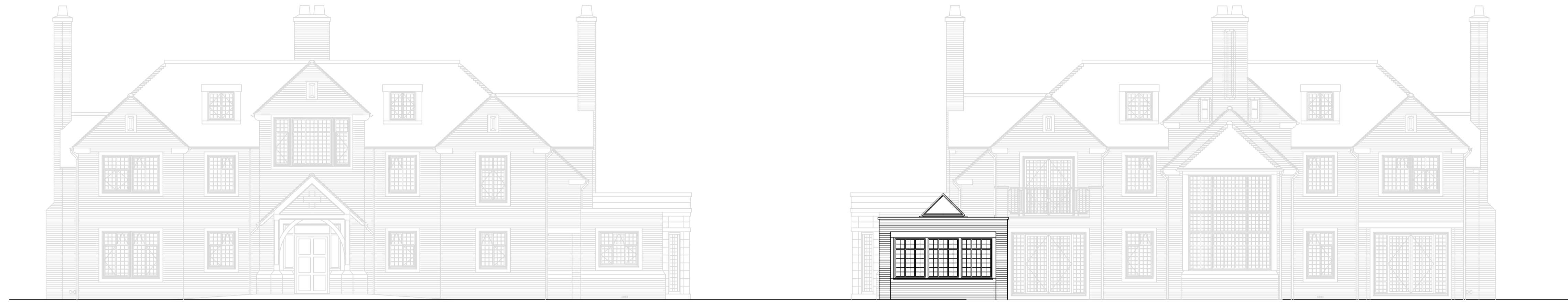
FRONT ELEVATION (UNCHANGED)