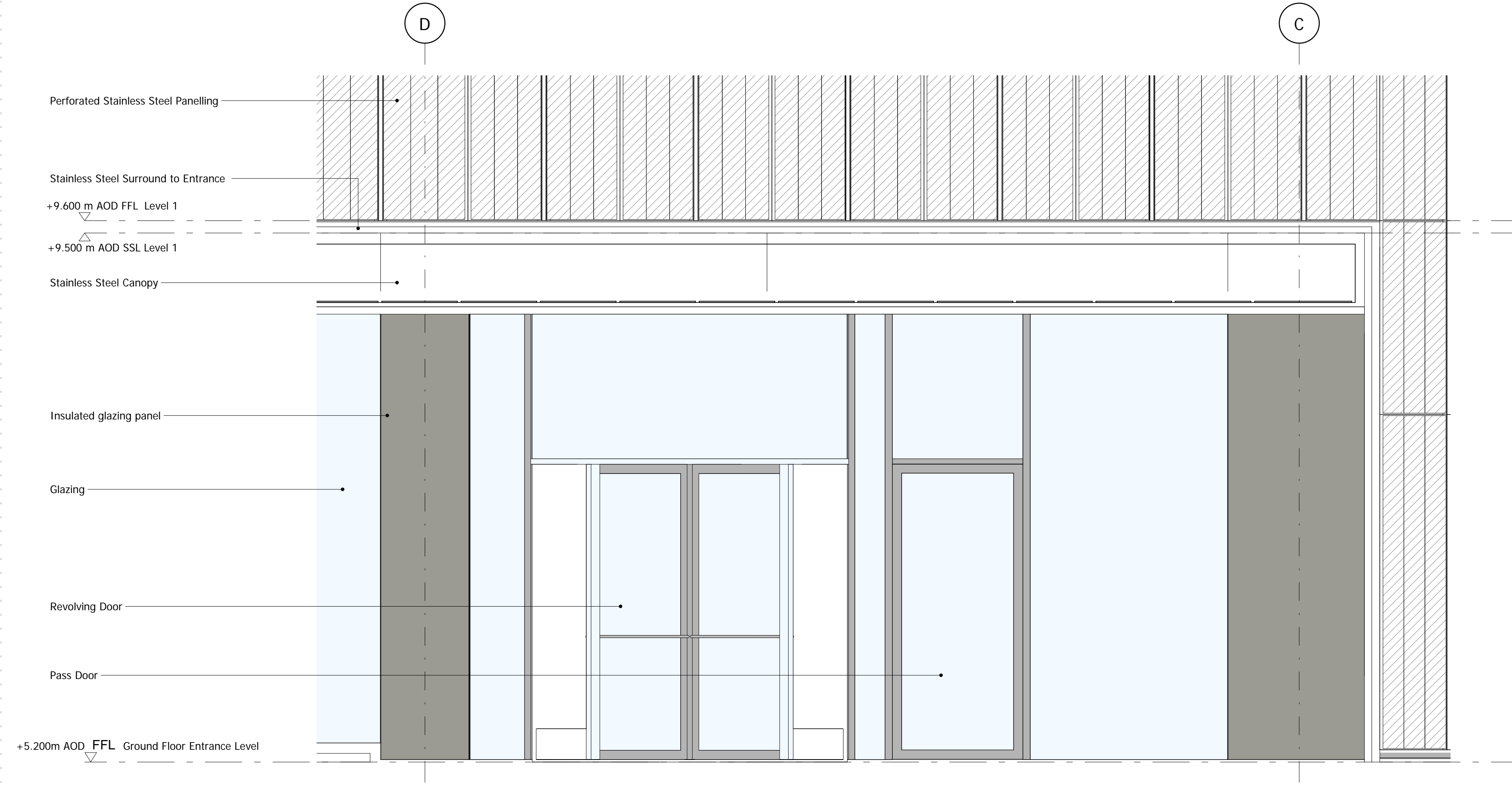
02 Ground Floor Serviced Apartment Entrance Elevation 1 : 25

NOTES: DO NOT SCALE FROM THIS DRAWING. ALL DIMENSIONS TO BE CHECKED ON SITE. ALL OMISSIONS AND DISCREPANCIES TO BE REPORTED TO THE ARCHITECT IMMEDIATELY. ALL RIGHTS RESERVED. THIS WORK IS COPYRIGHT AND CANNOT BE REPRODUCED OR COPIED OR MODIFIED IN ANY FORM OR BY ANY MEANS, GRAPHIC ELECTRONIC OR MECHANICAL, INCLUDING PHOTOCOPYING WITHOUT THE WRITTEN PERMISSION OF SQUIRE AND PARTNERS ARCHITECTS.