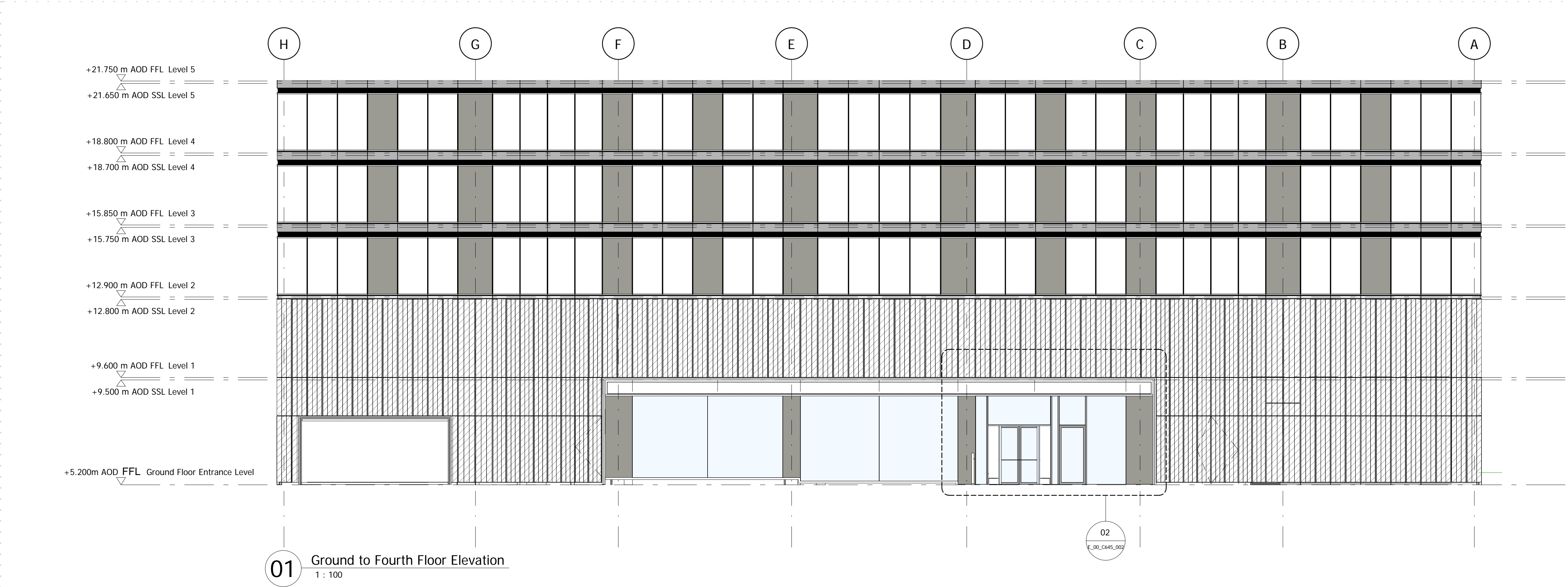
01 Ground to Fourth Floor Elevation 1 : 100