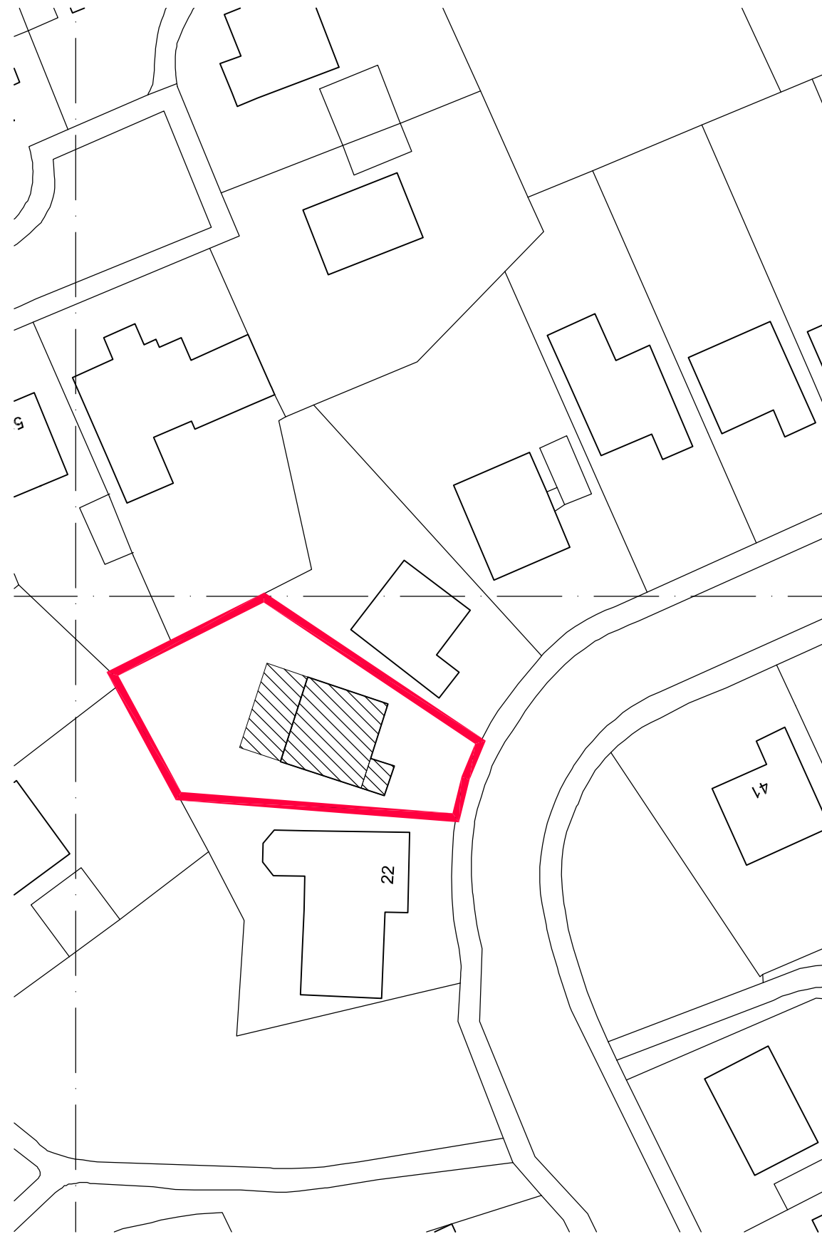
BLOCK PLAN AS PROPOSED