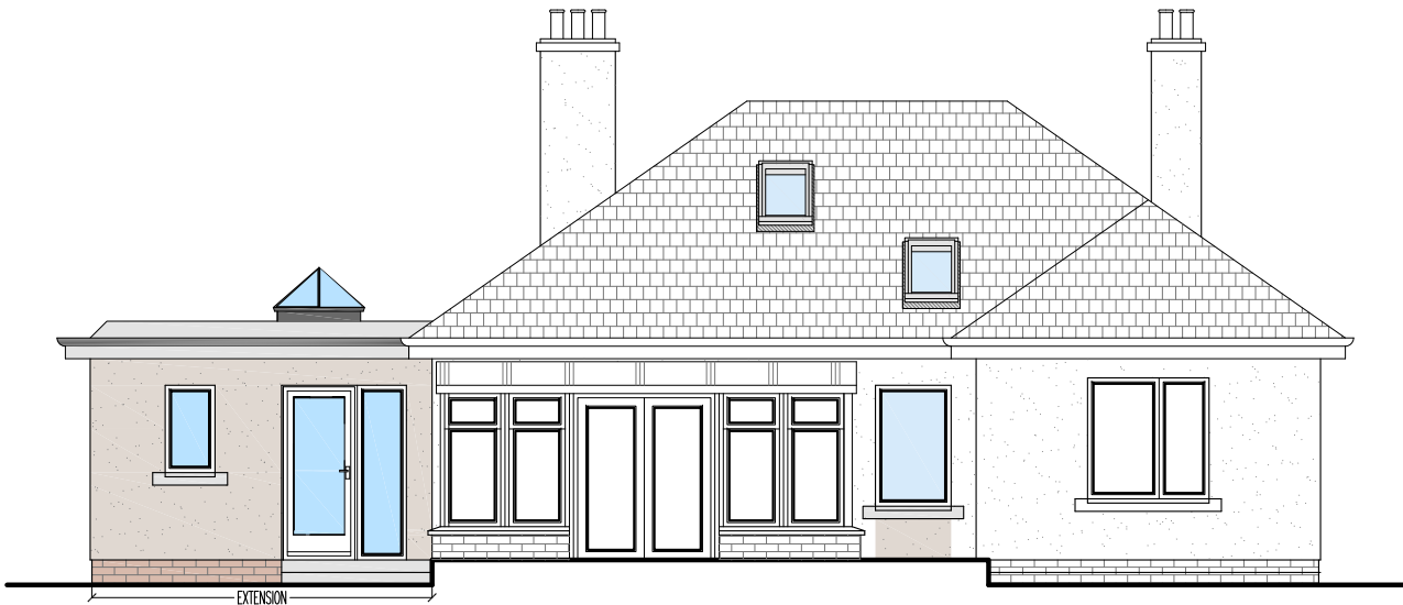
PROPOSED SOUTH ELEVATION scale 1:100

NOTES THIS DRAWING TO BE READ IN CONJUNCTION WITH ALL OTHER RELEVANT DRAWINGS AND SPECIFICATIONS. ALL DIMENSIONS AND LEVELS TO BE CHECKED ON SITE PRIOR TO CONSTRUCTION. ANY ERRORS TO BE REPORTED BEFORE COMMENCING WORK. ALL DIMENSIONS IN MILLIMETRES UNLESS OTHERWISE STATED - DO NOT SCALE. ALL WORKS TO BE CARRIED OUT IN ACCORDANCE WITH CURRENT BRITISH STANDARDS AND MANUFACTURERS INSTRUCTIONS AND SPECIFICATIONS. ALL WORKS TO BE CARRIED OUT IN ACCORDANCE WITH THE CURRENT LOCAL BUILDING AUTHORITY REGULATIONS AND TO THE BUILDING INSPECTORS SATISFACTION.