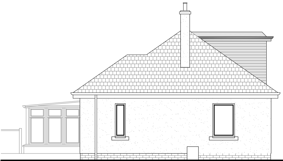
PROPOSED EAST ELEVATION scale 1:100