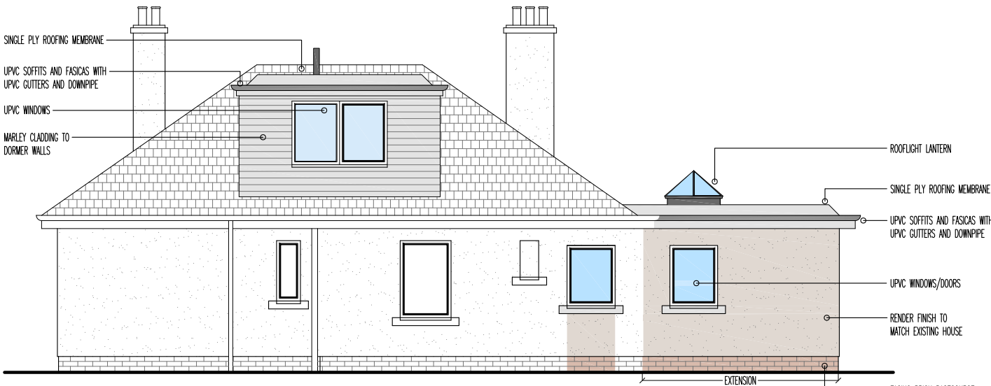
PROPOSED NORTH ELEVATION scale 1:100