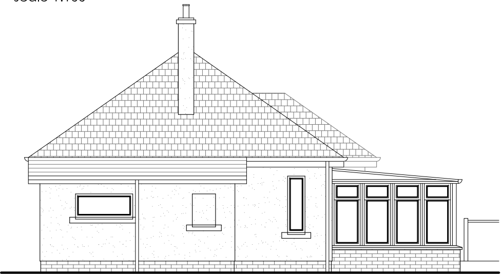
EXISTING WEST ELEVATION scale 1:100

NOTES THIS DRAWING TO BE READ IN CONJUNCTION WITH ALL OTHER RELEVANT DRAWINGS AND SPECIFICATIONS. ALL DIMENSIONS AND LEVELS TO BE CHECKED ON SITE PRIOR TO CONSTRUCTION. ANY ERRORS TO BE REPORTED BEFORE COMMENCING WORK. ALL DIMENSIONS IN MILLIMETRES UNLESS OTHERWISE STATED - DO NOT SCALE. ALL WORKS TO BE CARRIED OUT IN ACCORDANCE WITH CURRENT BRITISH STANDARDS AND MANUFACTURERS INSTRUCTIONS AND SPECIFICATIONS. ALL WORKS TO BE CARRIED OUT IN ACCORDANCE WITH THE CURRENT LOCAL BUILDING AUTHORITY REGULATIONS AND TO THE BUILDING INSPECTORS SATISFACTION.