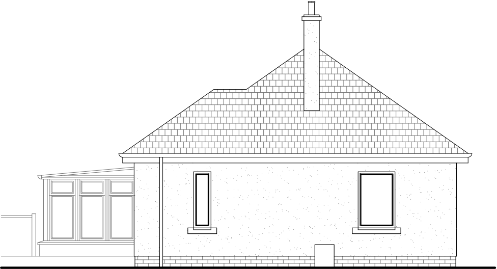
EXISTING EAST ELEVATION scale 1:100