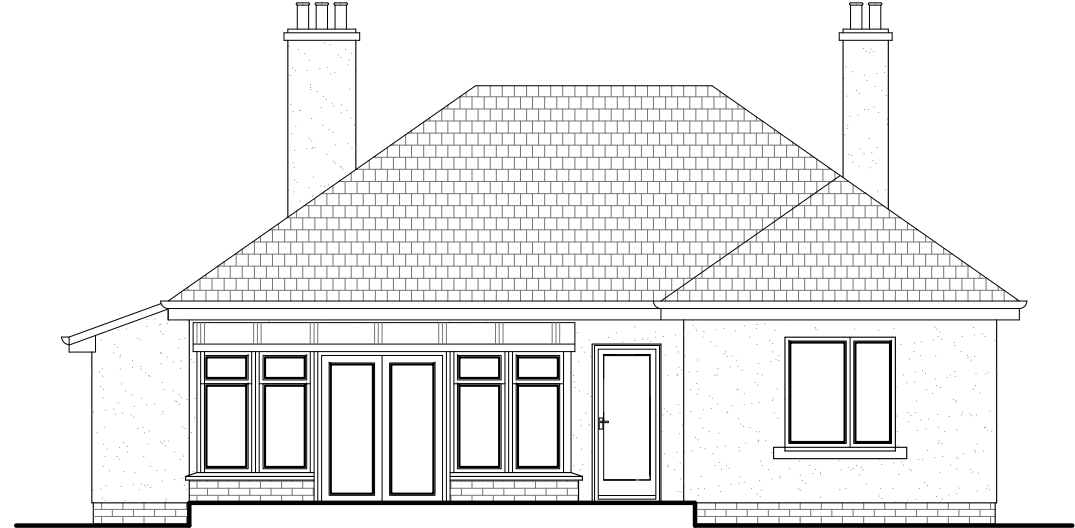
EXISTING SOUTH ELEVATION scale 1:100