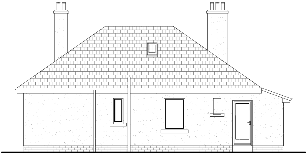
EXISTING NORTH ELEVATION scale 1:100