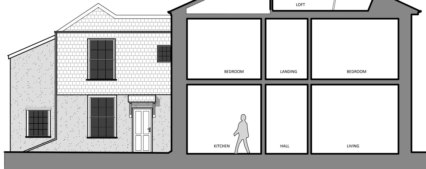
04 NORTH WEST EVATION