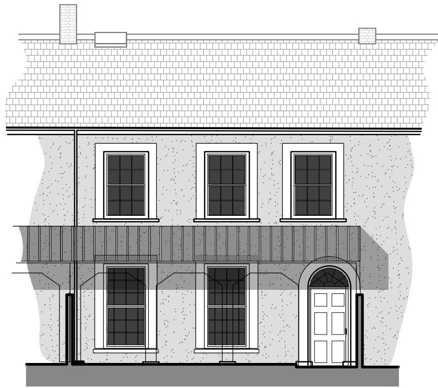
01 SOUTH WEST ELEVATION