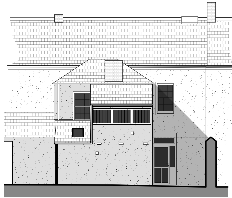
02 NORTH EAST ELEVATION