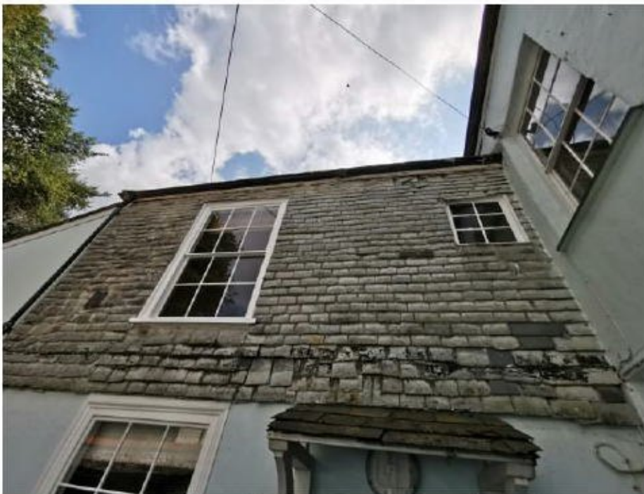
Photo 3. Showing the wall having slates on the rear extension