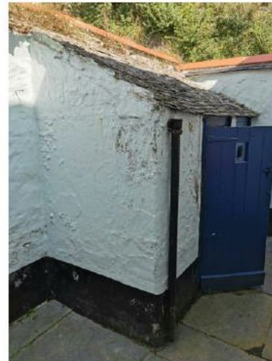
Photo 4. Showing the outbuilding

There is a single roof void over the main part of the house which has been lined internally, against the underside of the roof, and the floor is lined with floorboards creating a room. The gap between the lining and underside of the roof is lined with polystyrene insulation boards. However, this room does not have any windows, see photo 5. This room is accessed by a steep staircase and there is the remains of the roof void to the front and back outside the envelope of the room. The section of roof void to the east was accessed and inspected, it is open from the floor to the underside of the roof which is lined with bitumen felt, and the lining of the light well was also seen, see photo 6.