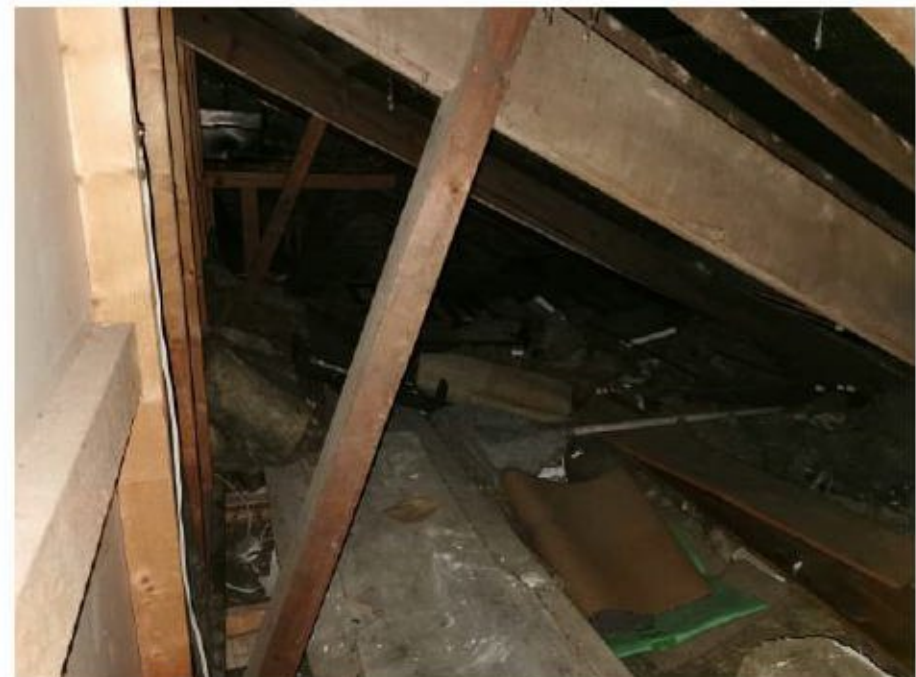
Photo 6. Showing the remaining area of roof void to the east

The roof void over the rear extension could not be accessed and is not linked to the roof void over the main house.