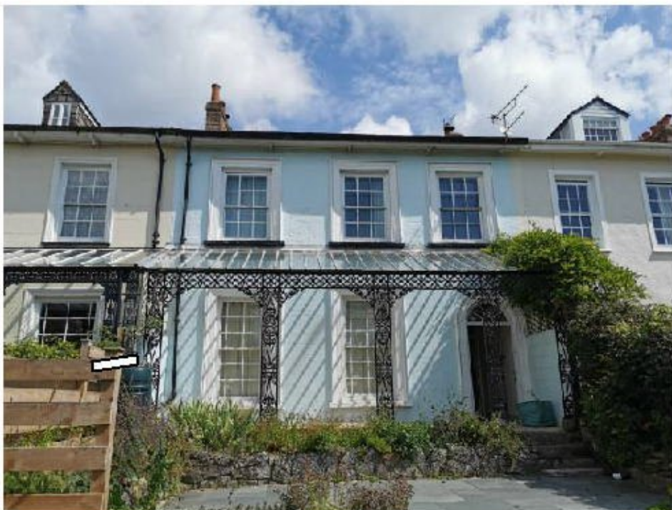
Photo 1. Showing the western side of the house

The building subject to this survey is large two storey early 19 th Century terraced house with a two-storey extension to the north. The terrace of houses sits on a high terrace raised above the road to the west looking out over the City of Truro and river. The main part of the house is rendered with the western face having the finer finish with a cast iron glazed veranda and the properties garden being to west. The roof on this part of the building is pitched and covered with slate and has a glazed light well built into the roof. To the east is a small, paved courtyard with the extension forming the southern side and contains a small outbuilding with a slate covered mono-pitched roof. The roof on the rear extension is hip ended and there is a lean-to on the end with a glazed side. The upper part of wall facing into the courtyard on the extension is clad with hanging slates which is in poor condition, see photos 1 to 4.