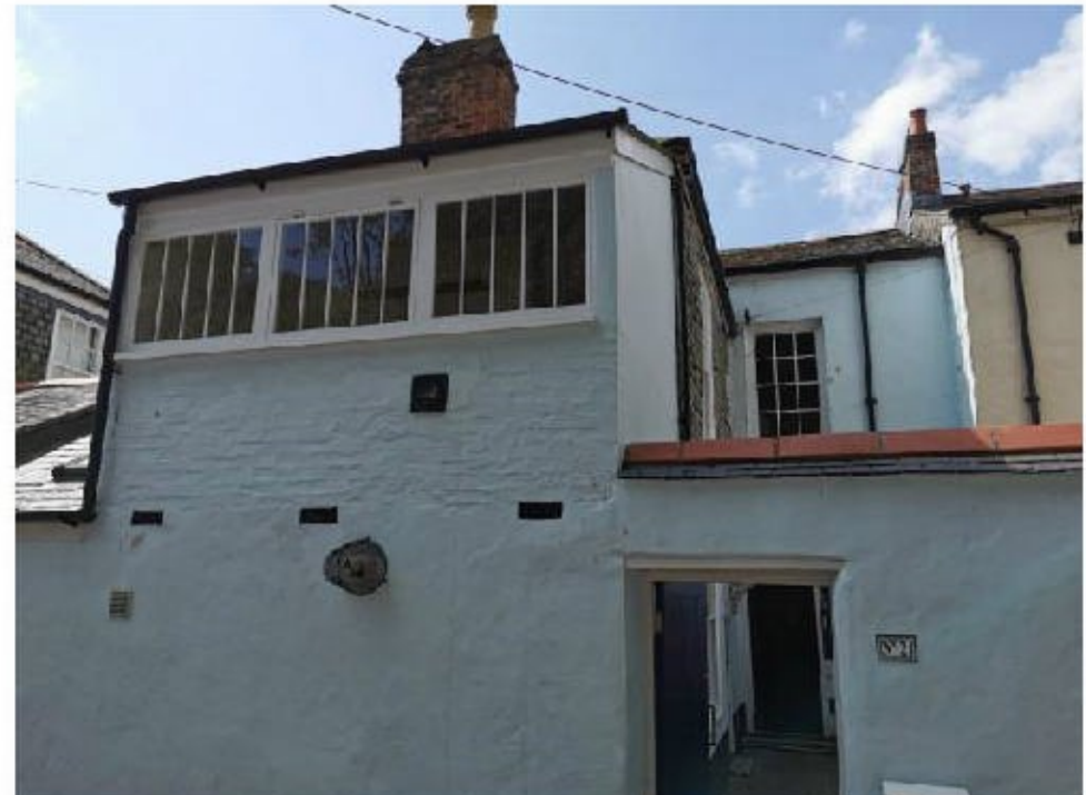
Photo 2. Showing the eastern side of the house including the extension