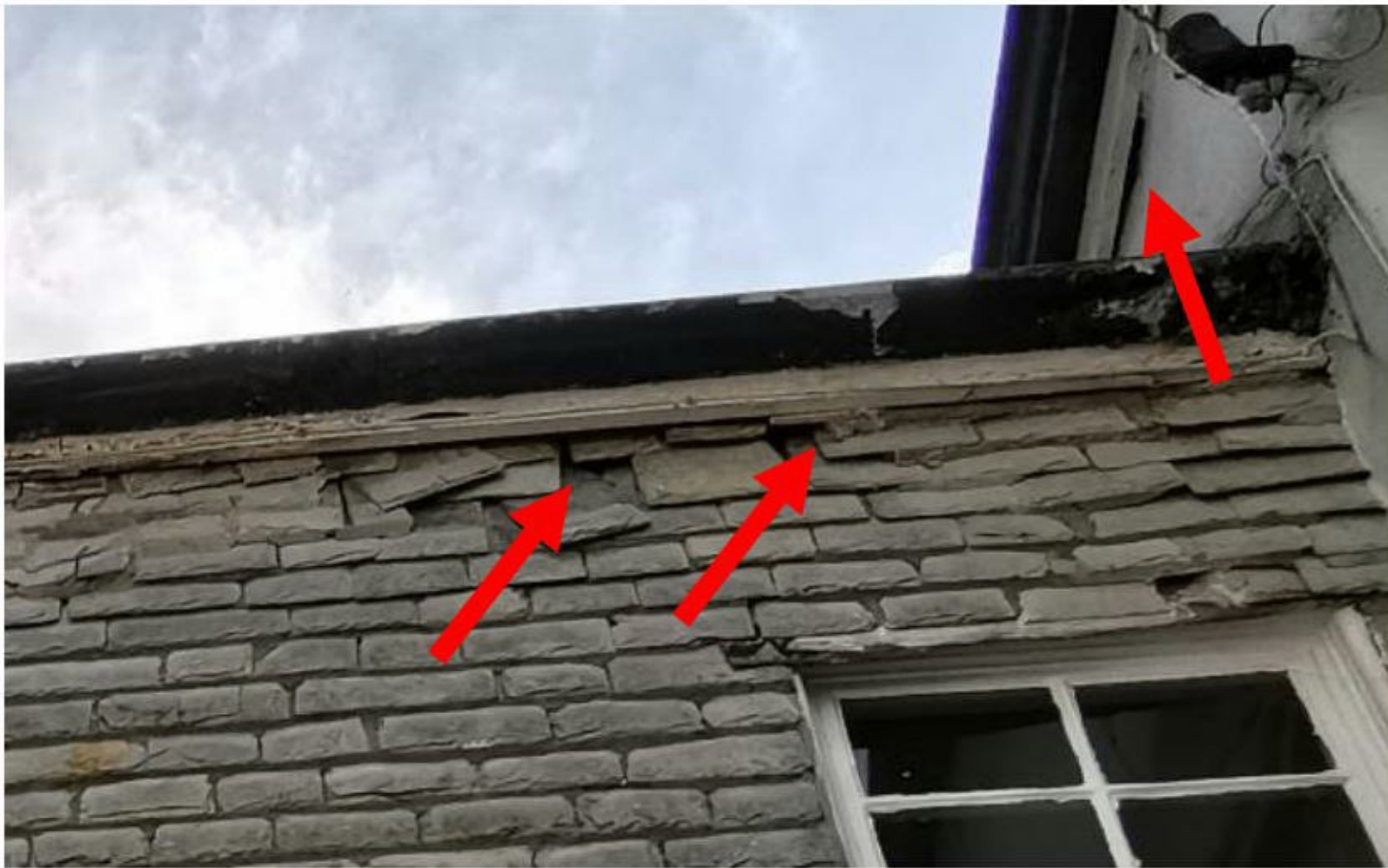
Photo 7. Showing the potential access points and roosting sites on the eastern side of the building

No evidence of the use of the building by roosting bats was found. However, a number of features with the potential to support roosting bats was found and the roof void over the rear extension could not be accessed. These features include a gap behind the fascia on the eastern side of the main section of the house above the extension, which creates potential access to the roof void and potential roosting sites in their own right, and a number of large gaps behind the hanging slates and at the eaves creating potential roosting sites and access points at the eaves which extend up and back into the roof void, see photo 7.