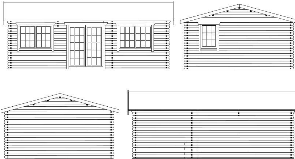
1 Existing Log Cabin Scale: 1:100