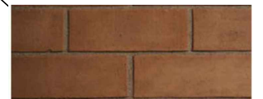
Class B Engineering Brick 2 x layers around perimeter base