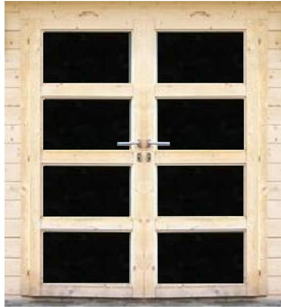
Rear, North elevation doors, Laminate frames, gasket sealed and mortise locks, Northern Scandinavian Pine and clear double glazed panes.