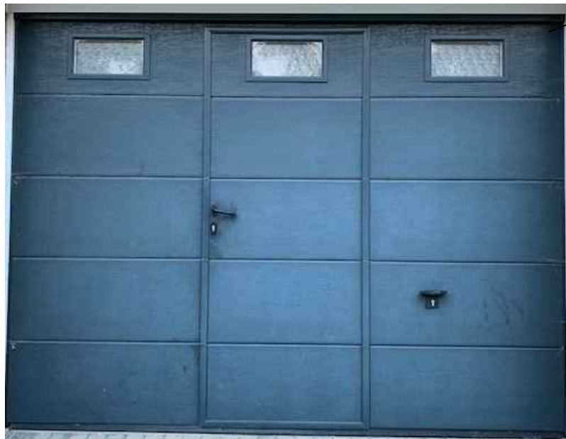
Reused and relocated existing integral garage Composite up and over/ roller garage door.