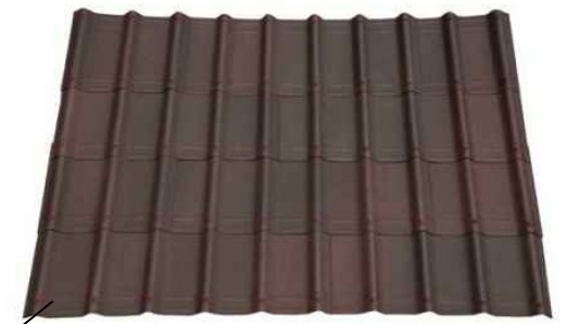
Villa style Onduline roofing tiles (shaded brown) offer a traditional tile profile (similar to heavier clay tiles). These recycled cellulose fibres soaked in bitumen tiles are lightweight, durable and eco friendly (15 year weatherproof guarantee).