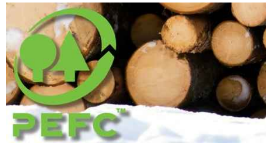
Simple horizontal Northern Scandinavian Pine timber construction (with 10yr warranty). Grade 5 kiln dried timber from a PEFC certificated forest that supports a programme of sustainable replanting.