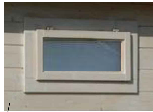
3 x High cill level Northern Scandinavian Pine, stippled opaque double glass windows, laminate frame and gasket sealed.