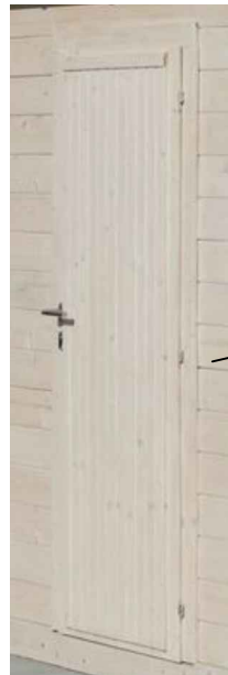
1 x Laminate frame, gasket sealed and mortise lock solid Northern Scandinavian Pine side access door.