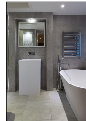
BATHROOM - OPTION