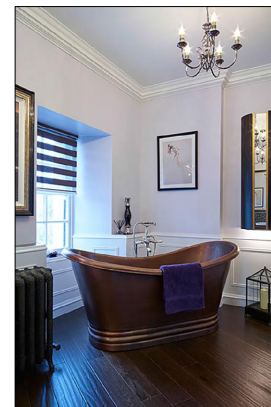
BATHROOM - OPTION