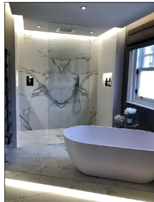
BATHROOM - OPTION