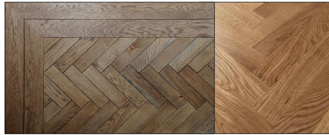
TIMBER PARQUET FLOORING