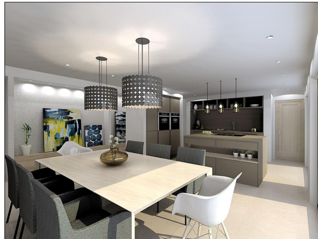
KITCHEN / DINING