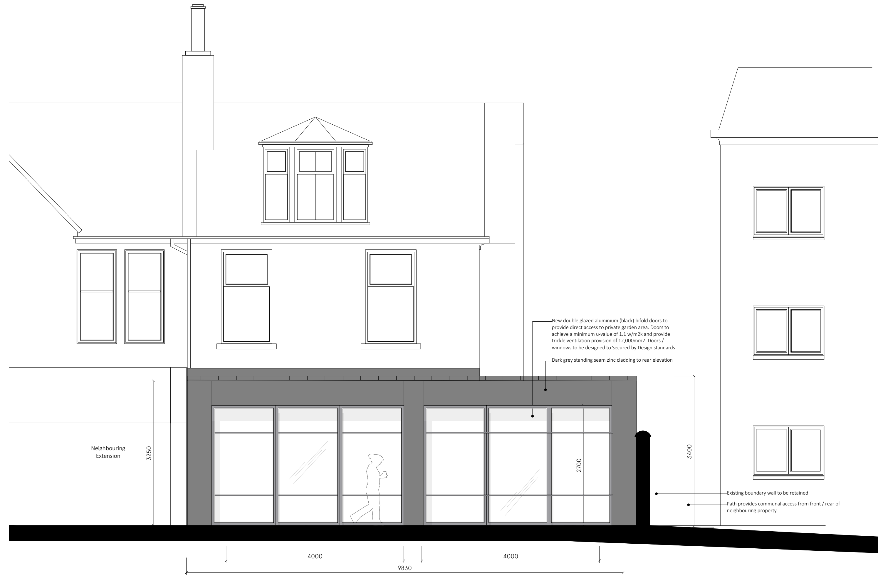
Rear Elevation - as existing Scale 1:50