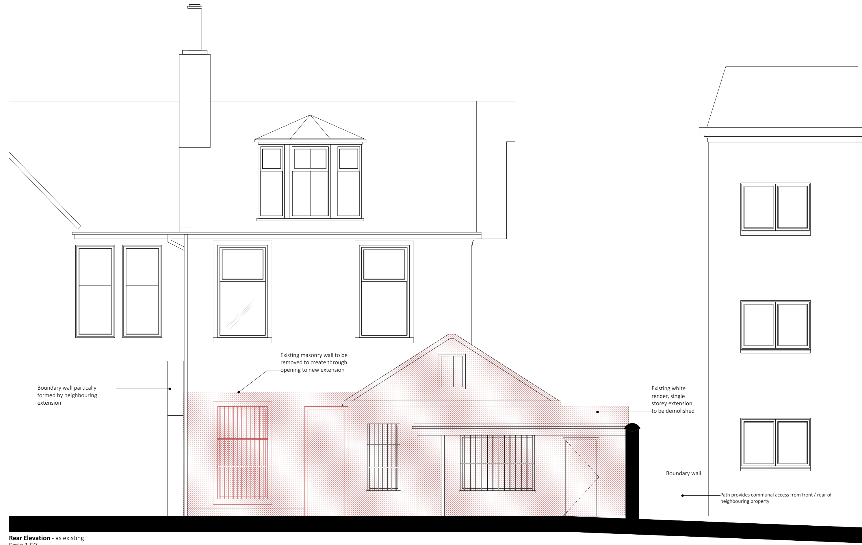
Rear Elevation - as existing Scale 1:50