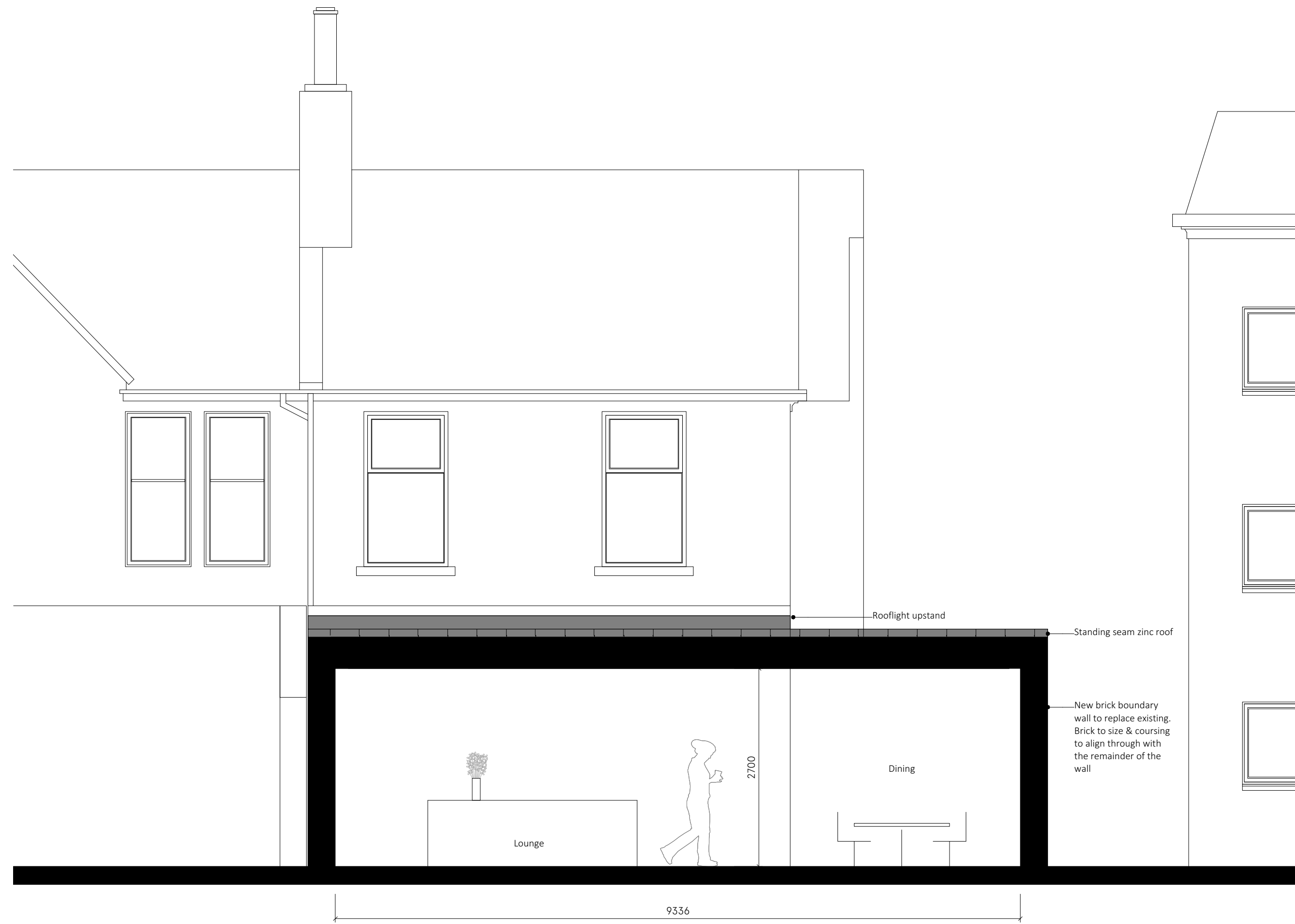
Rear Elevation - as existing Scale 1:50