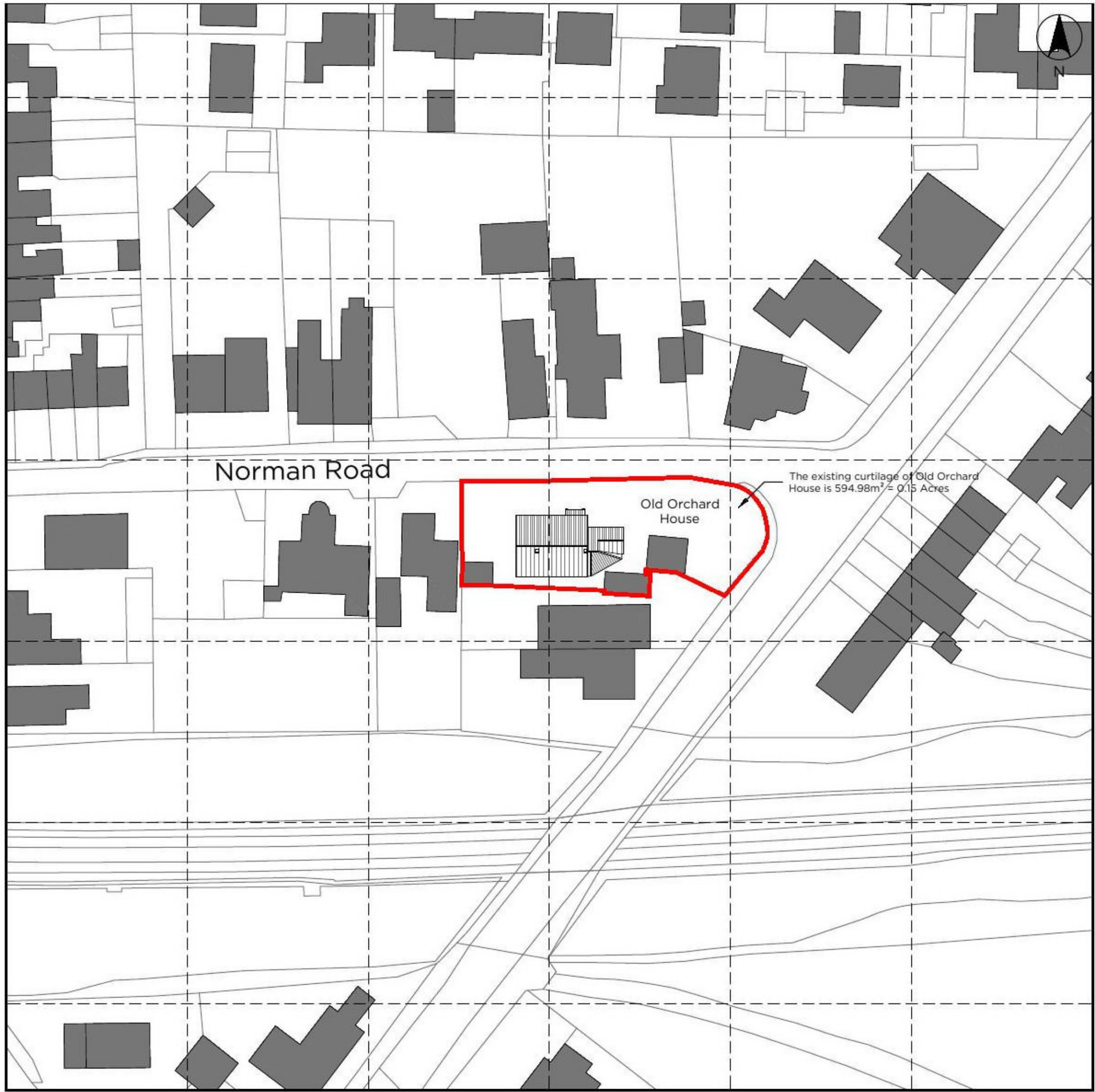
1.2 Existing Block Plan Scale 1:500

0m 10m 20m 30m 40m 50m 5m 15m 25m 35m 45m Scale 1:500 at A1