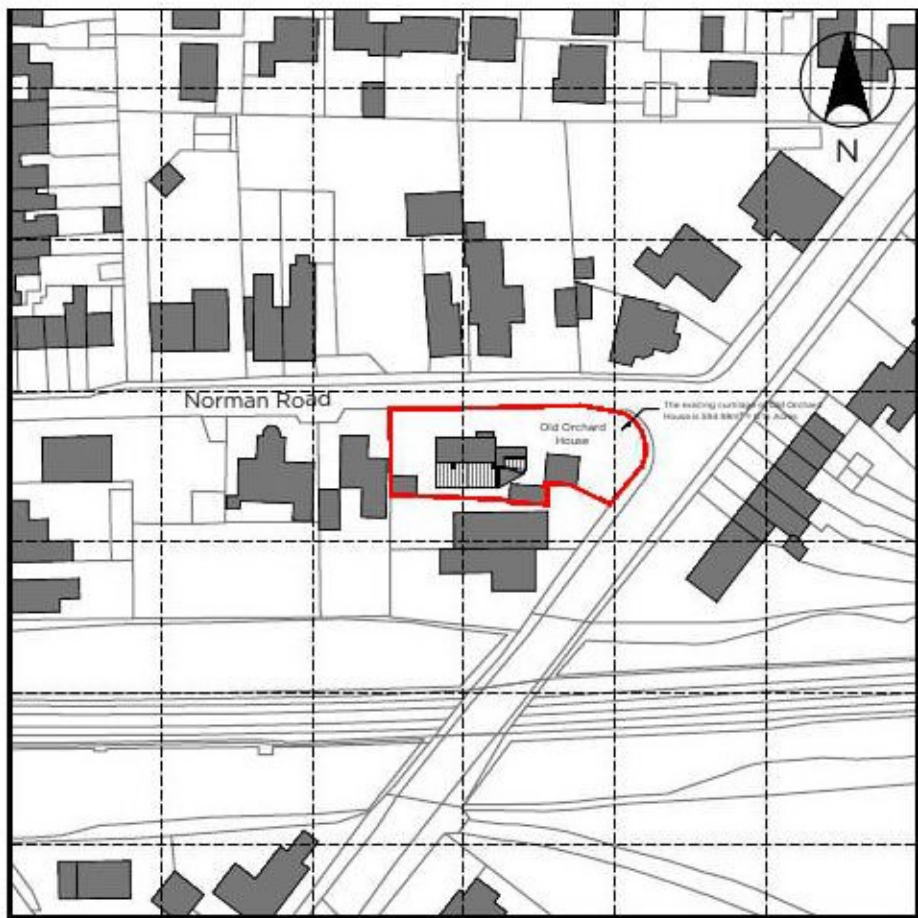
1.1 Existing Site Location Plan Scale 1:1250

0m 25m 50m 75m 100m 125m 12.5m 37.5m 62.5m 87.5m 112.5m Scale 1:1250 at A1